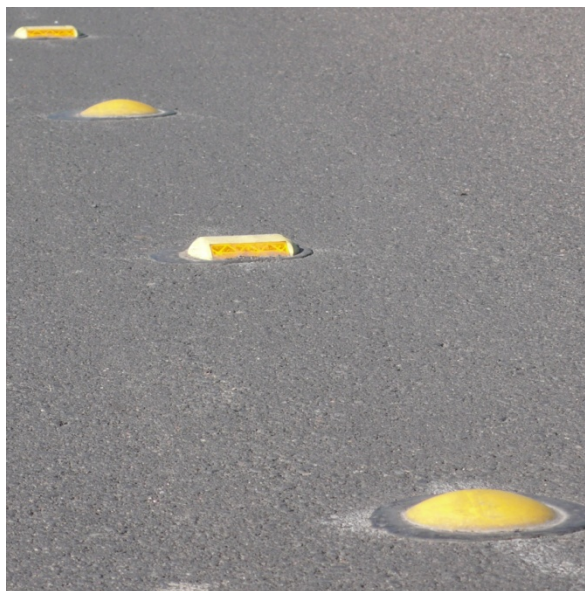
Fig. 3. Raised pavement markers

considered here is a simple round, domed marker. It is made from a non-reflective material and mounted with a bituminous or epoxy adhesive to an asphalt or concrete surface (ODOT 2010). The California Department of Transportation estimates that there are about 20 million Botts' dots on its roadways today (Caltrans 2010). That is enough to form a continuous line of Botts' dots stretching the length of US Interstate 5 from the US-Mexico border all the way to Tacoma, Washington.