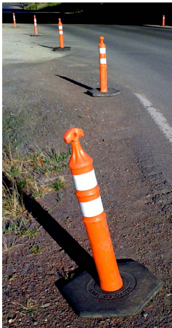
Fig. 4. Tubular markers