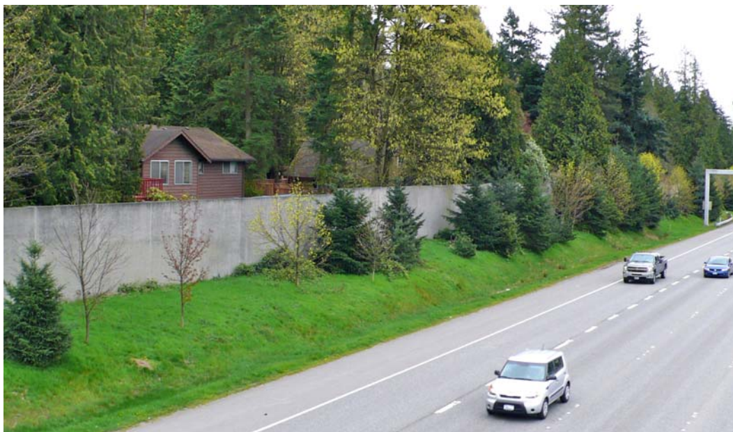
Fig. 5. A sound barrier wall

Sound barriers are structures along roadways used to mitigate noise from passing traffic, especially in residential areas (Figure 5). They are large installations designed for long service life. Performance characteristics of sound walls include sound transmission loss, structural requirements, weathering durability, and aesthetic acceptance (Land 2004). However in many cases they do not need to meet stringent collision requirements because they are generally offset from the road.