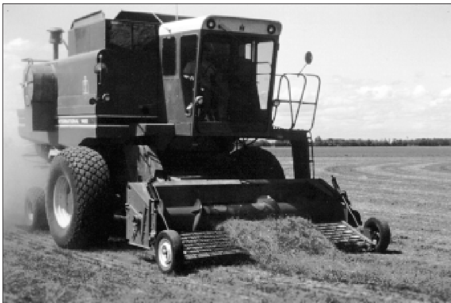
Figure 3.—Meadowfoam is harvested using conventional grass seed combines. Minimal residue remains in the field after harvest.