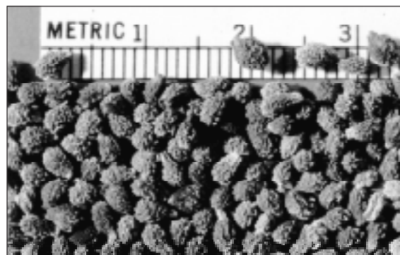
Figure 2.—Meadowfoam seeds contain 20–30 percent oil with a unique fatty acid composition.

Although growers have been successful using a seeding rate of 25 lb/a, avoid the temptation to stretch seed supplies with lower planting rates. Thin stands