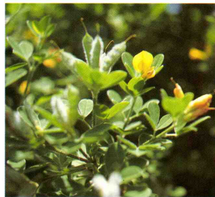
Figure 3.—French broom.