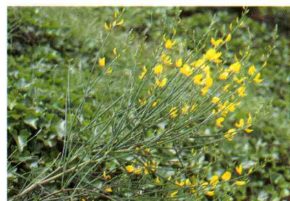
Figure 2.—Spanish broom.

Also, it is reported that ants aggressively collect the seed of Scotch broom, assisting in dispersal. Birds also assist with spread, but how well the seeds survive digestion varies with the species of bird.