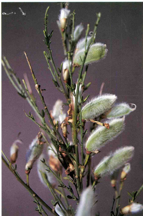
Figure 4.—Portuguese broom.