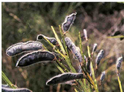
Figure 6.—Scotch broom brown seedpod.