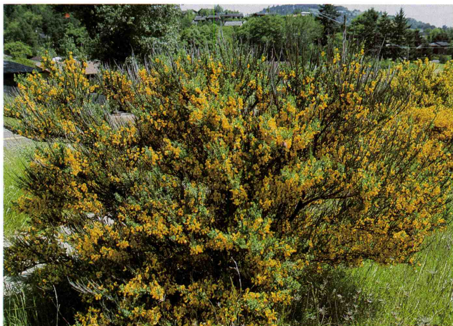
Figure 1.—Scotch broom.