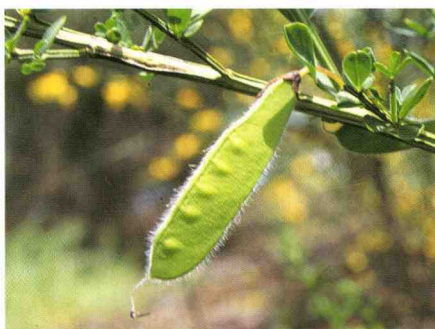
Figure 5.—Scotch broom green seedpod.