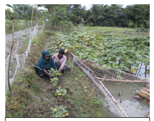
Image 2: Woman participation in dyke at the project area of PBAEP, Bangladesh cropping

Rural women from the most important productive workforce in the economy of majority of the developing nations including Bangladesh. If one goes beyond the conventional market oriented definition of productive workforce, almost all women in rural Bangladesh today can be considered as farmers in some sense working as wage labor, unpaid worker in the family farm enterprise, or some combination of the two. In Bangladesh, Indonesia, the Philippines and Thailand, women are heavily involved in post harvest activities, contributing 50-75 percent if all the handling, processing marketing and distribution of the fish catch ( Houriham , 1986 ). The villagers both men and women leaders religious person still believe in traditional gender division of labor in which men are responsible for outside work while women are of the household domain. Women are involved in various activities related to integrated pond farming in the chosen villages of project area. Most of the women interviewee reported that they usually do all the things related to fish farming within their household compound as if it's simply the extension of household chore. Not only that they likely to responsible raising vegetable garden, poultry along with the fishing and fish farming in ponds, in a sense women contribute significantly with the time and labor in these villages. Except harvesting and marketing they are involved more or less in dyke cropping gardening, fish feed preparation,