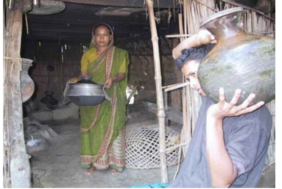
Image 5: The husband carrying drinking water for family as a part of his duty