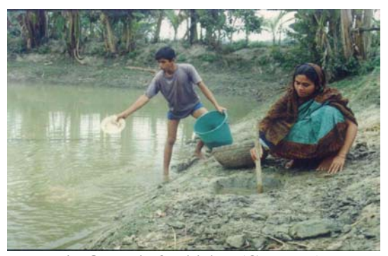
Image 4: Organic fertilizing (Compost) the pond with assistance from active project Woman fish farmer