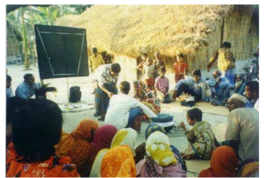
Image 7: A view of project Aquaculture Techniques training among the farmers by project extension officer