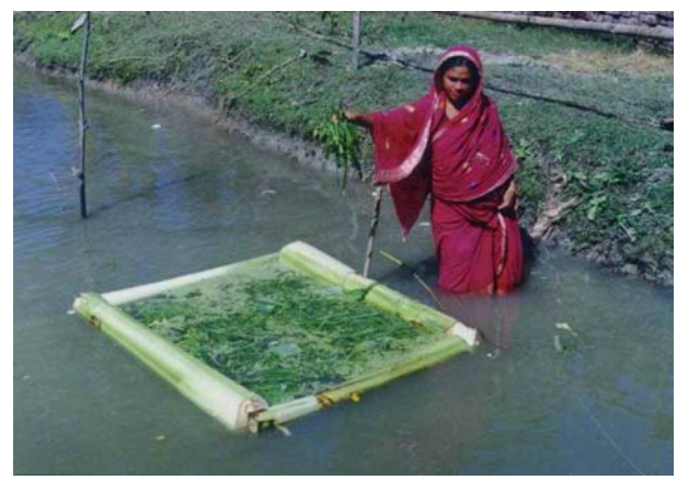
Image 3: Woman is applying vegetables in a feeding ring of her pond