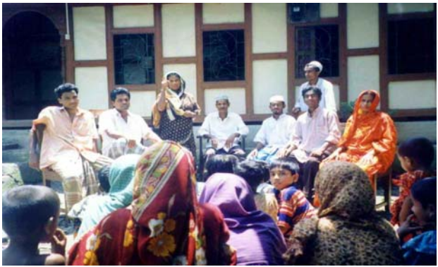
Image 6: A view of project monthly meeting whom more than 50% women participation