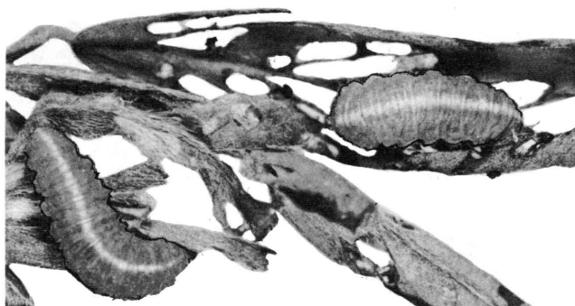
Alfalfa weevil larvae and typical leaf injury. The larvae are green with a white stripe down the back. Fully grown larvae are about \frac{3}{8} of an inch in length.

Starting in late May, small alfalfa weevil larvae may be found by sweeping the field with an insect net. Treatment usually should not be applied this early in the season because delayed egg hatching during periods of cool or inclement weather may produce larvae after the insecticide has lost its effectiveness.