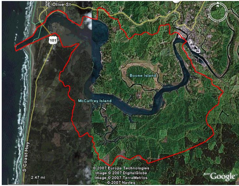
Figure 2: Yaquina Bay Focus Area Boundary (indicated in red)