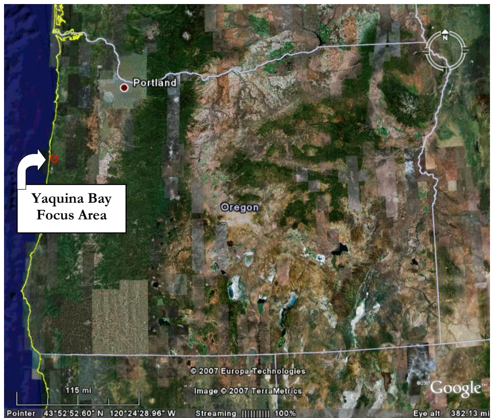
Figure 1: Oregon and the Yaquina Bay Focus Area

Our main objective when selecting our sample of five case study areas was to achieve a representation of diverse geographic regions, ecosystem types, land ownership and land uses within our sample. The Yaquina Bay study area, indicated by the red-bounded areas in Figures 1 and 2, represents the only estuary in our sample of conservation opportunity areas and the only area in our sample that is located in the Pacific Northwest. The remaining study areas can be broadly characterized into riparian (south-central Nebraska), mixed forest and swamp (southwestern Florida), low to mid-altitude dry forest (New Mexico), and temperate coastal mixed forest wetland (Maine), with a variety of different land use and ownership patterns.