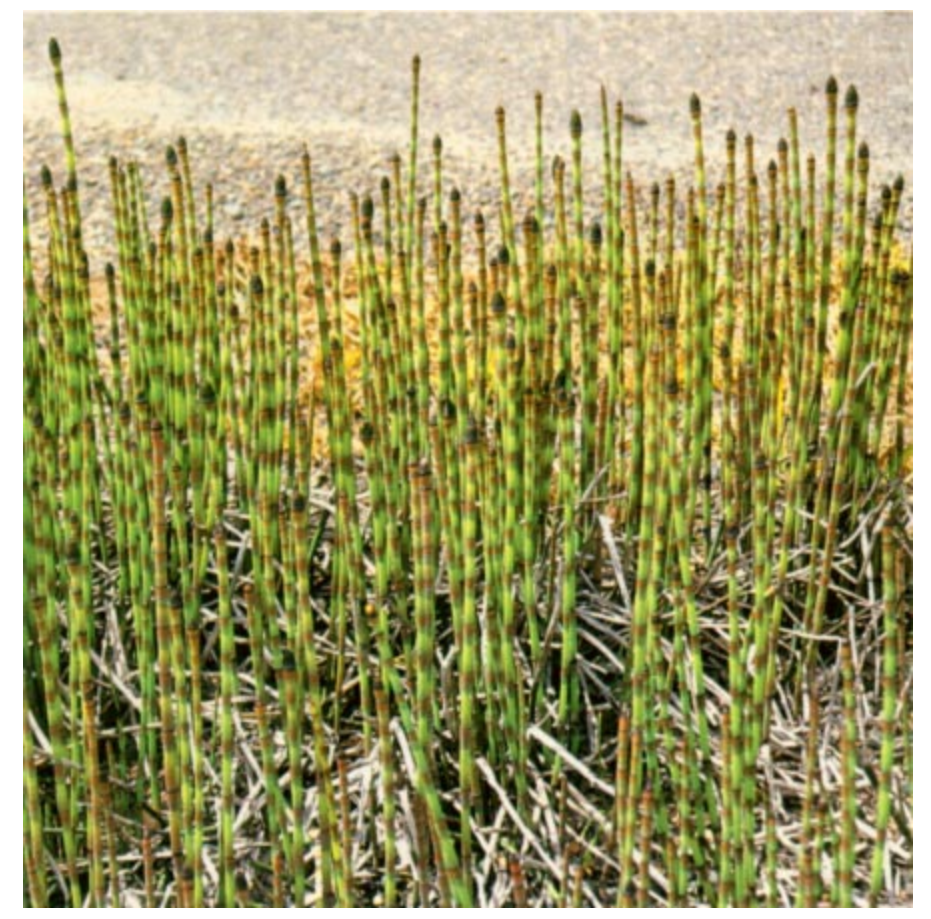
Figure 2.—Scouring rush often grows on roadsides.