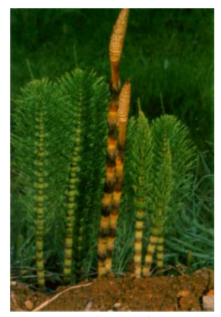
Figure 3.—Giant horsetail often grows in areas where the ground has recently been disturbed.

The three participating Extension Services offer educational programs, activities, and materials—without regard to race, color, national origin, sex, age, or disability—as required by Title VI of the Civil Rights Act of 1964, Title IX of the Education Amendments of 1972, and Section 504 of the Rehabilitation Act of 1973. The Oregon State University Extension Service, Washington State University Cooperative Extension, and the University of Idaho Cooperative Extension System are Equal Opportunity Employers. Published April 1974; Revised July 1994. 50 \phi / 50 \phi / 50 \phi