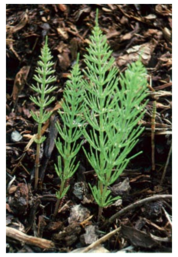
Figure 1.— Field horsetail.

Several species of horsetail and scouring rush are found in the Pacific Northwest. They are perennial, non-flowering plants that reproduce by spores. The spore-producing portion (cone) of the plant contains thousands of dust-like spores equipped with spring-like appendages that uncoil as the spores dry,