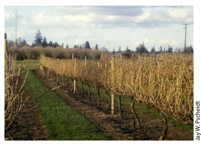
Figure 8. Shoots heavily infected by powdery mildew during the growing season can still be seen in the dormant season as dark canes. The set of vines in the middle of this row were not sprayed for powdery mildew the year before.