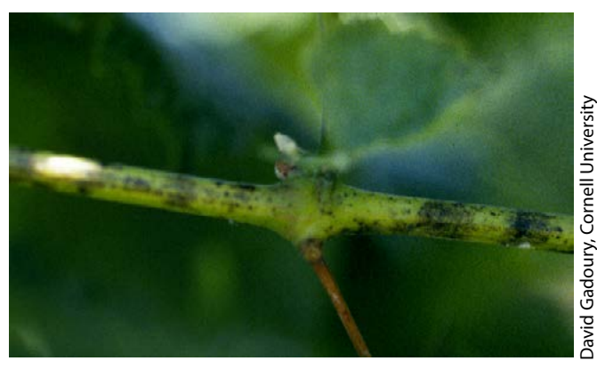
Figure 7. Colonies on stems look like dark feathery spots or stains.

When you are scouting, keep in mind that you are looking for something different or unusual. Keying in on every spot or leaf blemish can be time consuming and frustrating. It takes some experience and training to efficiently find early powdery mildew colonies. Your persistence will be rewarded when you do find the disease and can take swift action. The payoff is an improved powdery mildew management program.