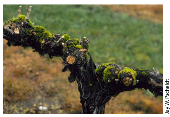
Figure 3. Trunk and cordon with exfoliating bark where cliestothecia of powdery mildew overwinter.

and turn over a few leaves that are in tight groups close to the bark. Repeat this process for several vines in the area, and you may catch the start of the epidemic.