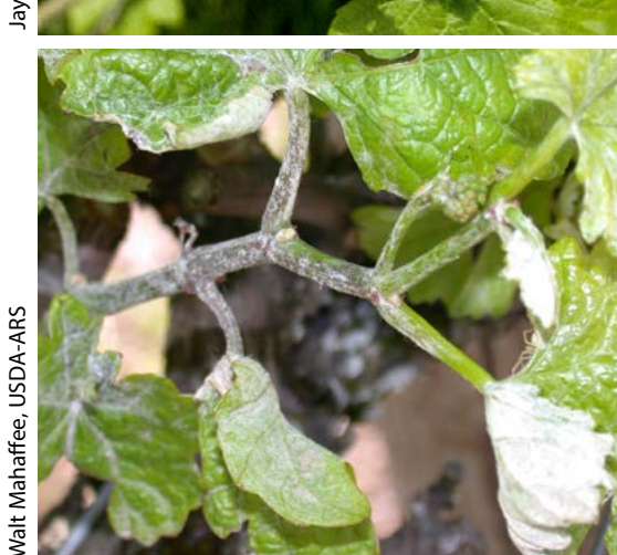
Figure 6. Flag shoots of powdery mildew soon after bud break in the spring.