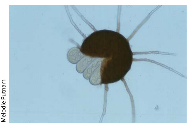
Figure 2. Cleistothecium squashed open to show several asci with ascospores.