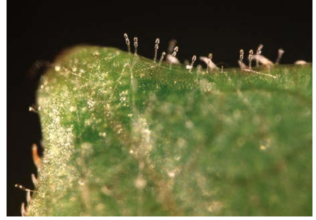
Figure 5. Look for chains of conidia with your hand lens to confirm powdery mildew. Note that the mycelium is very sparse in this colony.

Flag shoots may be found well before you plan to start your fungicide program. This is a serious situation requiring quick action. Remove the shoot and either bury it on site or place it in a sealable plastic bag so you do not spread spores to other areas of the vineyard. Removal of the flag shoot is good, but spores may have been distributed already, and infections may have started that are not yet visible. For this reason,