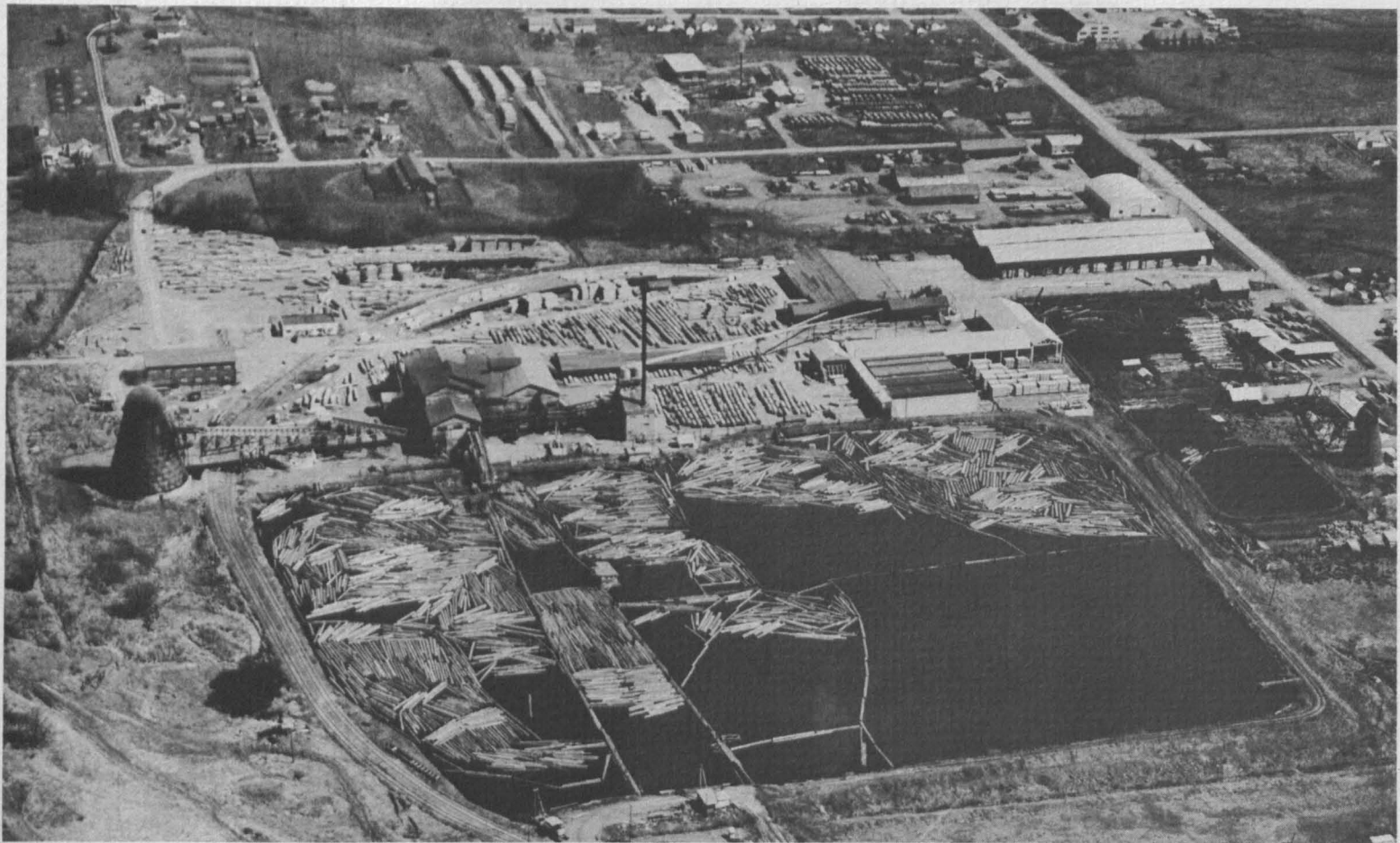
Youngs Bay Lumber Co., Roseburg