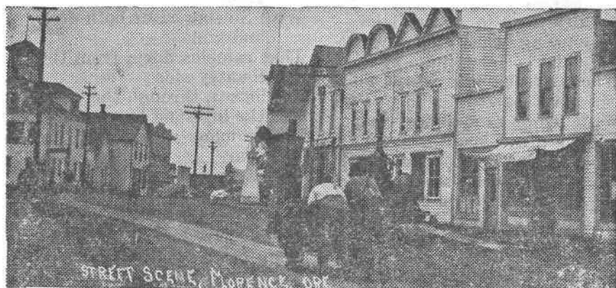
Front Street in the Early Days, Looking Westward