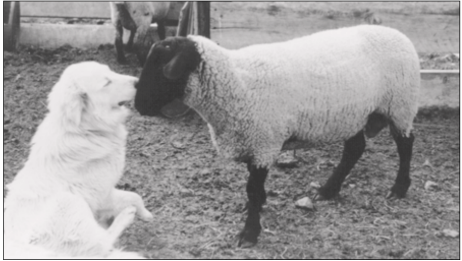
Figure 2a.—These three different submissive poses of an adult Maremma allow sheep to investigate, and each one fosters dog–sheep bonding. Here, eyes are squinted and ears are back; forepaw and rear leg are raised. The dog is prepared to roll over on its back as in Figure 4a.

Approaching sheep with ears back and squinted eyes, avoiding direct eye contact, and lying on the back are called submissive behaviors (Figure 2). Sniffing around the head or anal areas is called investigatory behavior . Both are desirable behaviors, signs that your dog has the right instincts and is working properly.