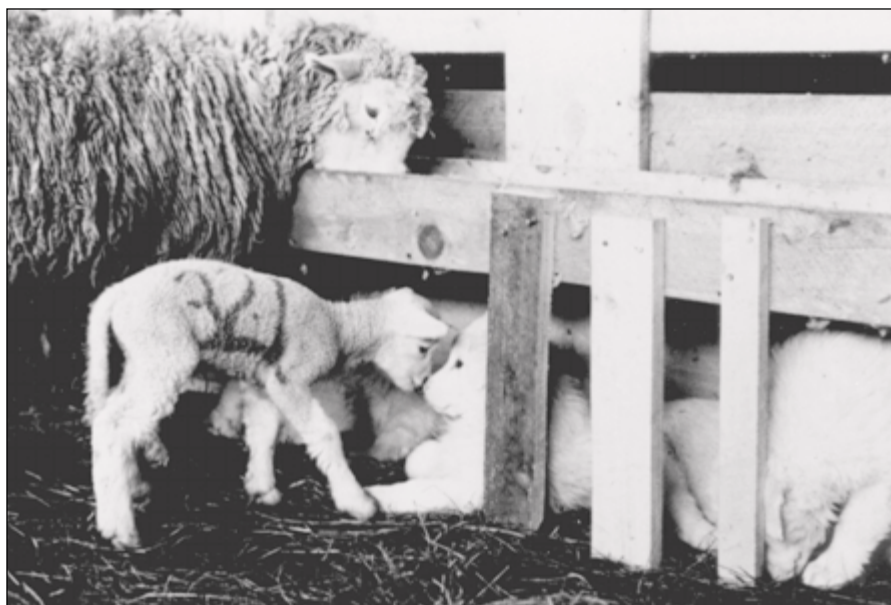
Figure 1.— These 8-week Maremma pups are being raised in the lambing barn. The vertical boards nailed to the feed trough give pups a place to escape from a ewe that may butt. Sniffing nose-to-nose is the start of social bonding. Note the similarity of the interaction between this lamb and pup to the ram and adult dog in Figure 2b.

Training a livestock-guarding dog is primarily a matter of raising the dog with sheep to establish a social bond between sheep and dog (Figure 1). It's a process that depends on supervision to prevent bad habits from developing and on establishing limits of acceptable