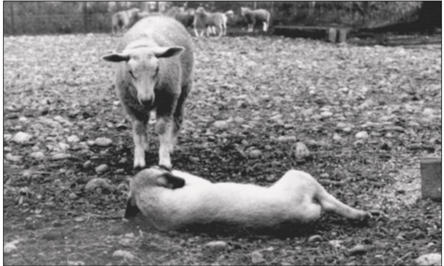
Figure 4a.—At 16 weeks of age, this Anatolian pup is in a well-fenced dry lot with ewes. The pup's submissive posture allows sheep to investigate.

These examples work well for ranchers who want to keep their dog in distant pastures, away from the house, and away from constant shepherding. Remember the concept: If you want your dog to