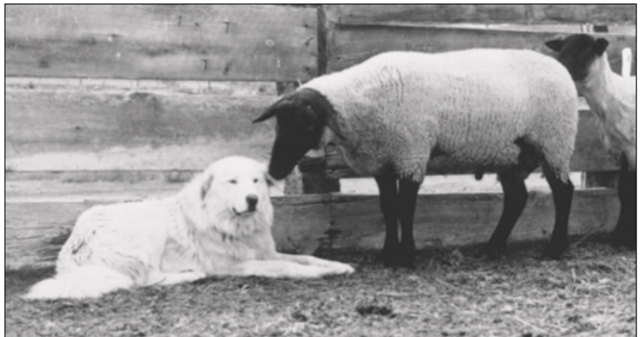
Figure 2c.—Again with squinted eyes and ears back, the dog avoids direct eye contact with sheep.