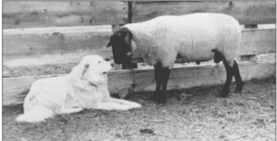
Figure 2b.—Eyes are squinted, and ears are back in this nose-to-nose sniffing.