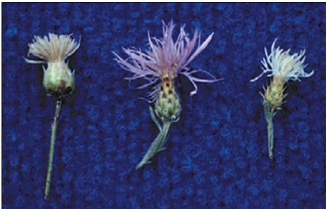
Figure 9.—Flowers of Russian knapweed (left), spotted knapweed (middle), and diffuse knapweed (right).