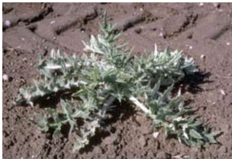
Figure 1.—Bull thistle rosette.

pinkish purple flowers, which appear from July through September, are 1.5 to 2 inches wide and are usually solitary. Seeds are dispersed by the wind and may remain viable in the soil for 10 years.