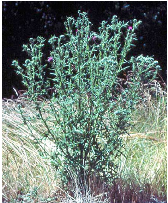
Figure 2.—Second-year (mature) bull thistle.

Note: Before you apply herbicide on forest land, you must file a “notification of operations” with the Oregon Department of Forestry at least 15 days in advance. The following information about herbicides is only a brief