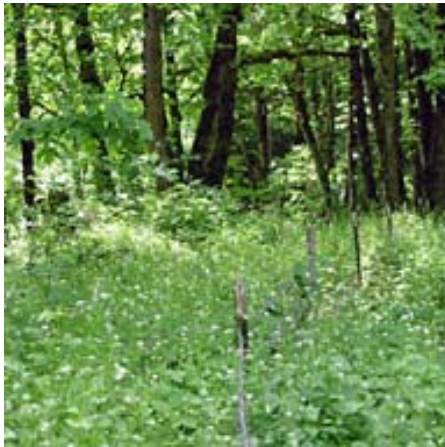
Figure 1.—Garlic mustard in forested understory.

Garlic mustard is a biennial herb with stalked, coarsely toothed leaves that are triangular to heart-shape (Figure 2) and give off the odor of garlic when crushed. Seeds germinate in early spring and create very high seedling densities. First-year plants appear as rosettes close to the ground. The plants overwinter as green rosettes and develop into a flowering plant the following spring