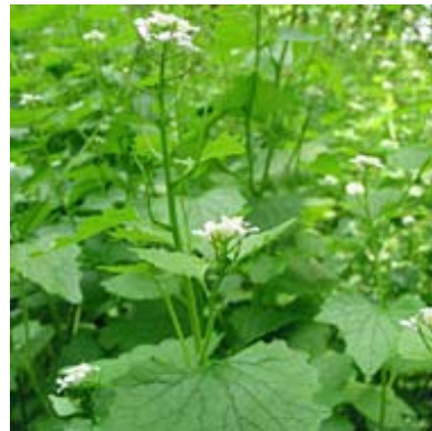
Figure 2 (far left).—Garlic mustard leaves.