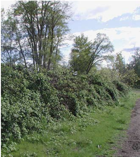
Figure 1.—Typical blackberry domination in the understory of a riparian area.

Oregon riparian zones (Figure 5, next page). Commonly found in riparian areas, it also grows along roadsides and fence corridors and in open woodlands, logged areas, and other disturbed sites. It grows best on deep, fertile soils but can colonize