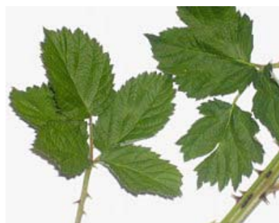
Figure 3 (far left).—New canes emerge from rhizomes (underground creeping stems).

The blackberry leaf rust fungus ( Phragmidium violaceum ) has been used for decades to control native blackberry plants in Australia and New Zealand. It was discovered in 2005 on the Oregon coast and has since spread to all western Oregon counties except Jackson and Josephine. The rust infects the leaves of both Himalayan and evergreen blackberry, causing partial to complete defoliation. Tip rooting is also reduced. However, the plants are not killed outright. Some individual plants and plant populations appear to be more resistant to the rust