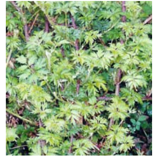
Figure 2.—Evergreen blackberry.

Himalayan blackberry plants can produce up to 13,000 seeds per square meter, and seeds can remain viable in the soil for several years. Leaves are alternate, palmately compound, and oval with serrate edges (Figure 4). Plants bear white flowers and black fruits. Canes (stems) are ribbed and have thorns. Evergreen blackberry is similar in growth habits but has compound leaves that are deeply serrated (Figure 2).