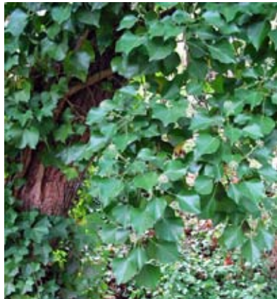
Figure 2.—Ivy in flower.

lobes that often have white veins. The mature, fruiting stage grows in open sun and has heart-shaped, unlobed leaves on upright stems bearing umbrellalike clusters of greenish white flowers in fall (Figure 2). Dark purple to black, berrylike fruits, with one to three stonelike seeds, develop in spring. Ivy reproduces from rootlike stems, sprouting fragments, or seeds. Seeds are spread by birds. The bird's digestive tract helps scarify seeds, which improves germination. Ivy grows in a wide variety of soils, and it tolerates drought, frost, and deep shade.