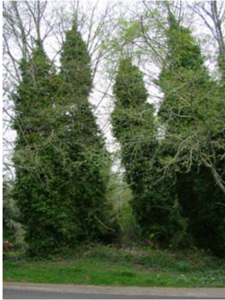
Figure 1.—Ivy can kill large overstory trees.

Ivy is an evergreen vine with thick, waxy leaves and distinct immature and mature growth stages. The immature, vegetative stage grows rapidly both along the ground or climbing, in shade or sun. Its leaves are dark green, with three to five