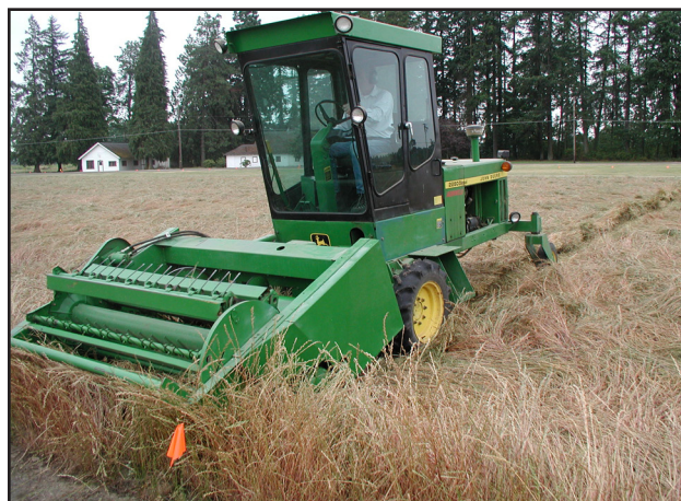
Figure 3. Swathing annual ryegrass research plots at Hyslop Research Farm, OSU.

design of the research plots was a 10 treatment factorial design swathed at five different seed moisture contents and at two daily timings (when the dew was on the crop and later the same day when the dew was gone). Seed yield results with a graphical representation are presented in Chart 1. Harvesting at 40 percent or lower seed moisture content resulted in significant decreases in harvested seed yield. Also, swathing with dew on the stand (night or early morning) increased yield when seed moisture content was 40 percent or lower. Seed shattering was visually evident when the plots were swathed at lower seed moisture content. Though seed size (as measured by 1,000-seed weight) increased as the crop was swathed at lower seed moisture content, the small increase in seed size failed to compensate for the loss in seed yield from shattering. Seed germination was not affected by any of the swath timings and averaged 96.9 to 98.7 percent.