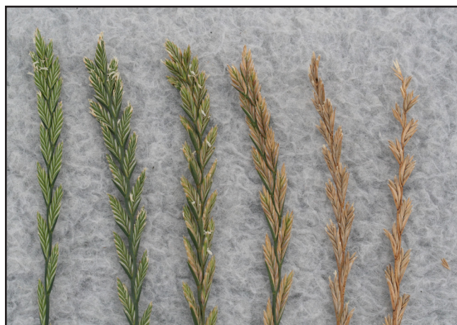
Figure 2. Range of head maturity in perennial ryegrass field.

Recent swathing studies indicate that maximum seed yields for annual ryegrass are obtained when average seed moisture content is from 40 to 45 percent at the time of swathing, (Table 1). The experimental