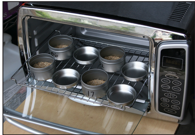
Figure 10. Convection oven with seed samples.

Other testers. Conductivity-type grain/seed moisture testers are typically not accurate at the higher seed moisture contents that are typical for grass seed swathing times but are very useful for checking harvested seed to ensure the moisture level is safe for storage.