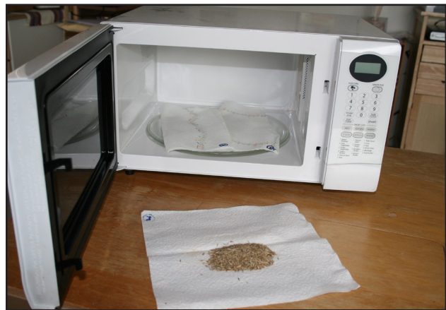
Figure 11. Microwave oven with seed samples ready to dry.