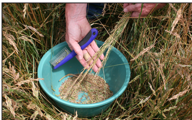
Figure 8. Stripping tall fescue seed heads.

Prior to taking a field sample, assess the uniformity of the field. Take a sample that best represents the crop maturity over most of the field. If some areas in