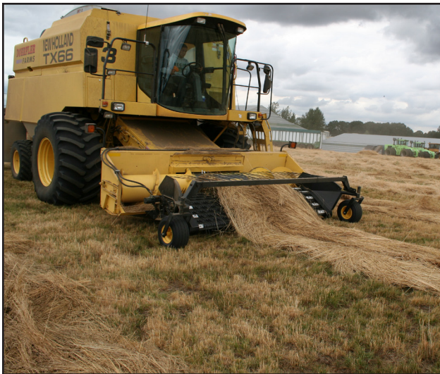
Figure 6. Harvesting fine fescue seed moisture trial plots.