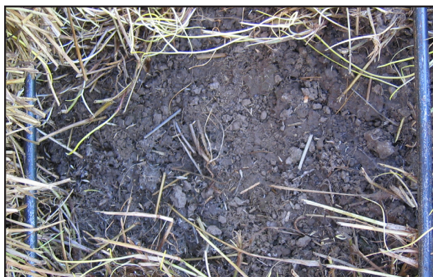
Figure 4. Between rows under swath at early cut timing.