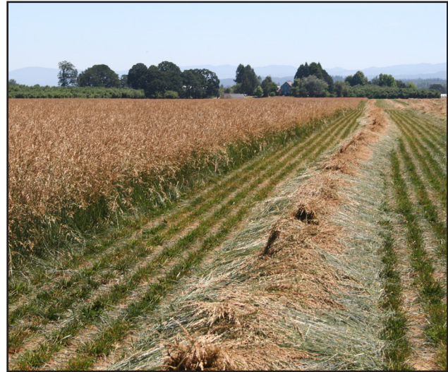
Figure 1. Field of tall fescue at swathing.