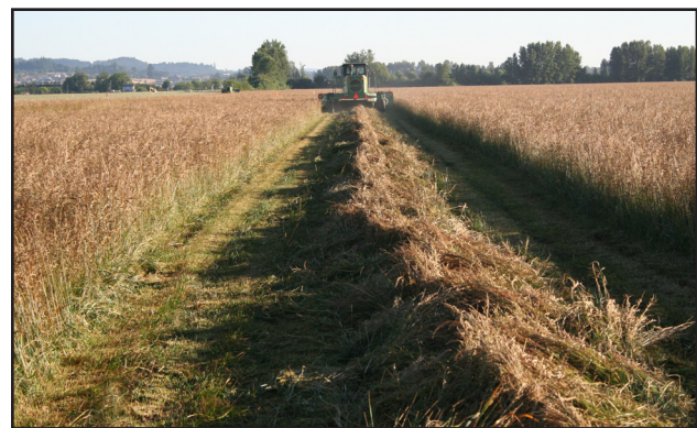
Figure 7. Swathing tall fescue seed moisture trial plots.