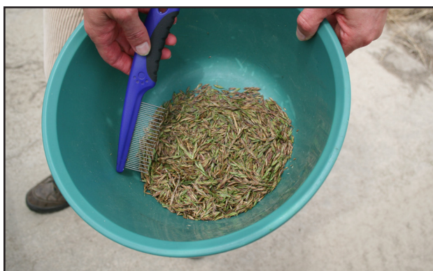
Figure 9. Example of tall fescue seed ready to check for seed moisture.

the field are greener or more mature, take samples from those areas separately. Sample the field once the dew is off the field and the plants have air-dried (usually by mid to late morning) to prevent external moisture from affecting the sample taken. It is important to sample at about the same time each day to help determine daily seed moisture loss.