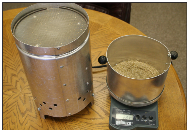
Figure 12. Koster moisture tester.