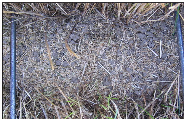
Figure 5. Between rows under swath at late cut timing.