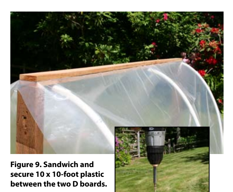
Figure 9 insert. Secure the plastic with 1.5-inch screws.

(For more wind resistance, you can wrap the plastic once around the first D board and then sandwich it with the other D board. You also can attach a hook to the outer D board at each end and two hooks to the frame. Attach bungee cords between the two hooks to prevent wind from flapping open the curtain.)