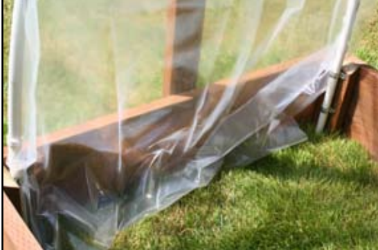
Figure 6 insert. Plastic should be tucked against the end of the frame and trimmed to fit.

Figure 6. Attach the 5 x 5-foot 6-mil polyethylene plastic sheeting to the ends of the cloche using PVC clips.