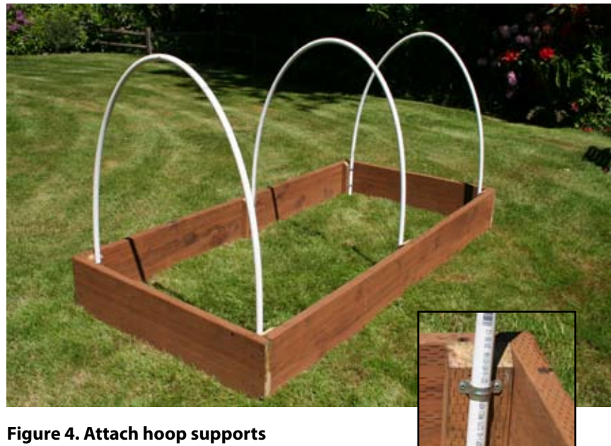
Figure 4. Attach hoop supports to the raised bed base with pipe straps.