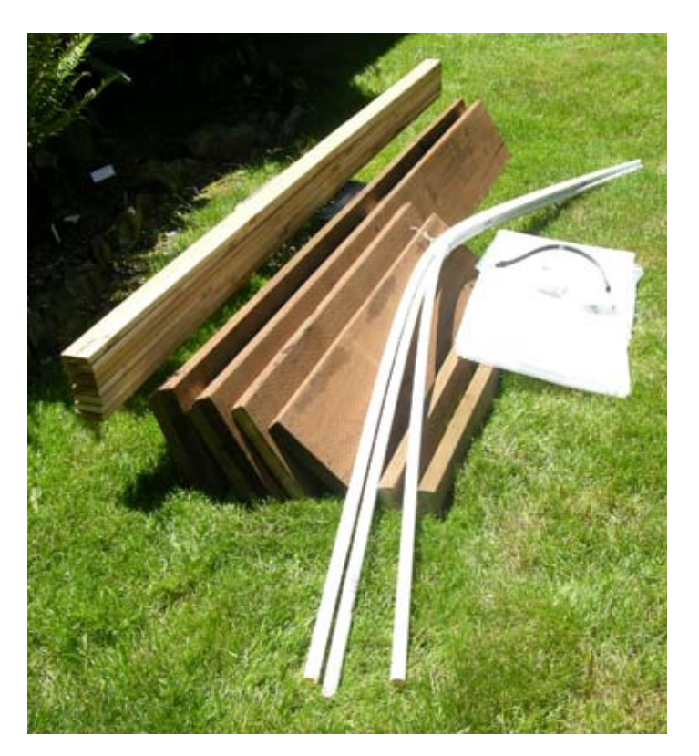
Figure 2. Materials needed to build an 8 x 4-foot cloche.