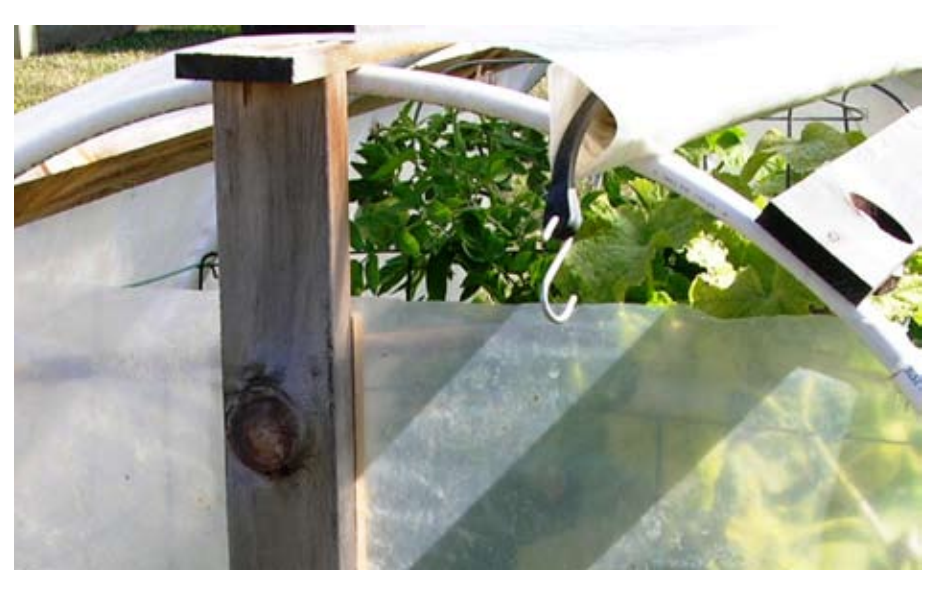
Figure 13. In warmer areas, cut out and leave open the top 6–12 inches of each end, for ventilation.