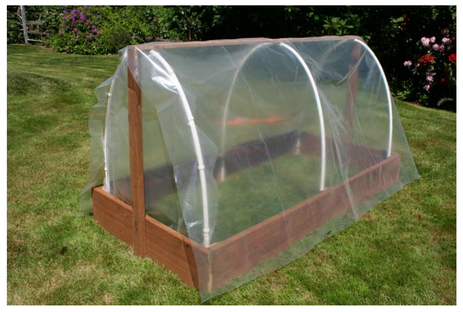
Figure 8. Drape the 6-mil 10 x 10 polyethylene plastic sheeting over the hoops of the cloche.