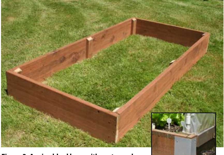
Figure 3. A raised-bed base with center and corner supports for an 8x4-foot cloche.

(Instead of using pipe straps, you can attach sections of 1-inch PVC pipe to the anchors and just insert and anchor the 0.75-inch hoops into these sleeves.)