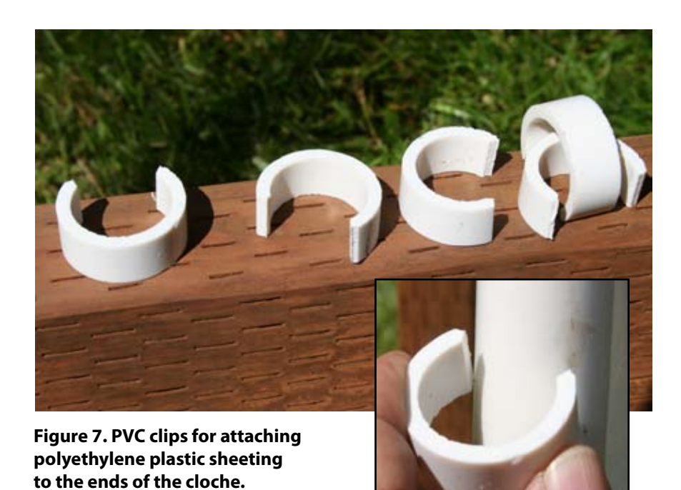
Figure 7 insert. Attach PVC clips to hoop.

Drape the 10x10 piece of 6-mil polyethylene plastic sheeting over the hoops, making sure each end and the bottom sides are even (Figure 8). Do not trim excess plastic until later.