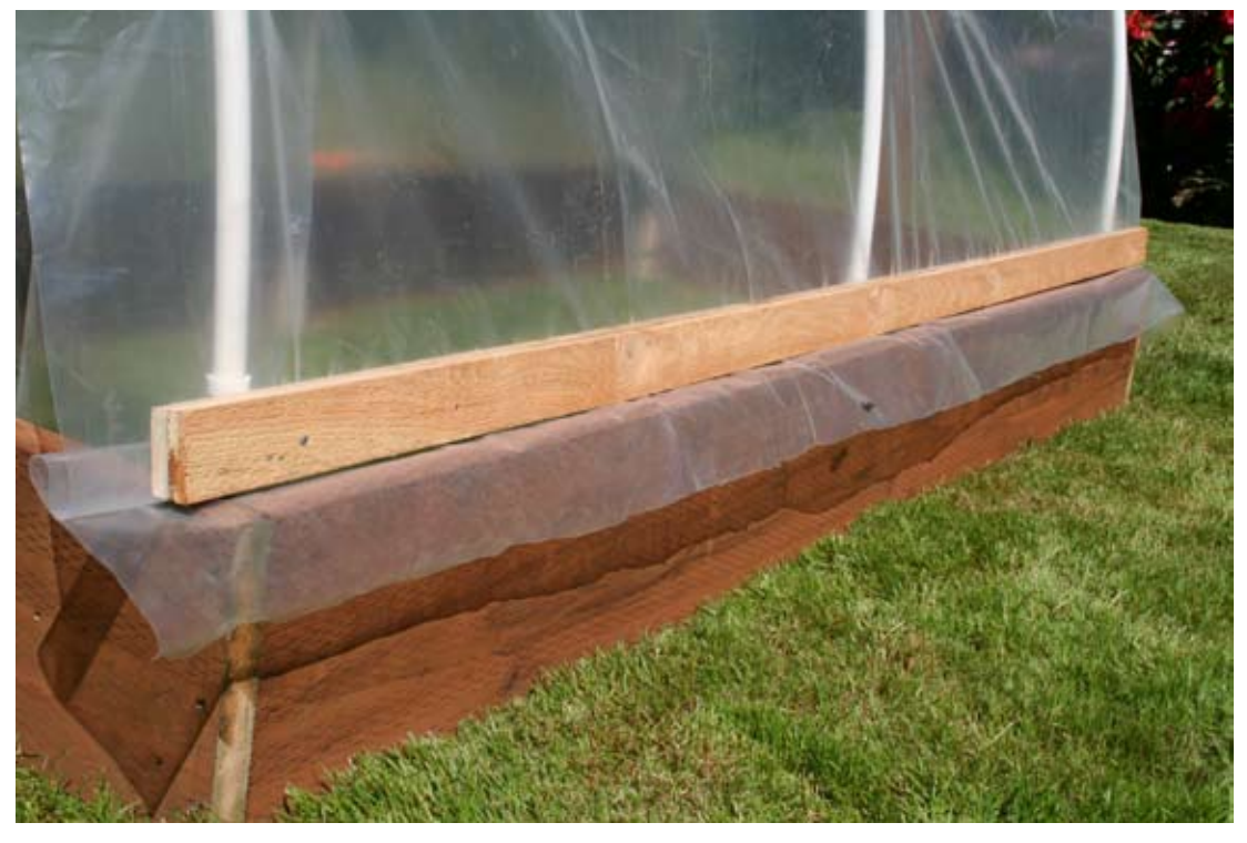
Figure 10. Secure the side curtain plastic with two D boards that sandwich the plastic and rest on top of the raised bed. Trim excess plastic, but leave 6 to 8 inches of overhang.