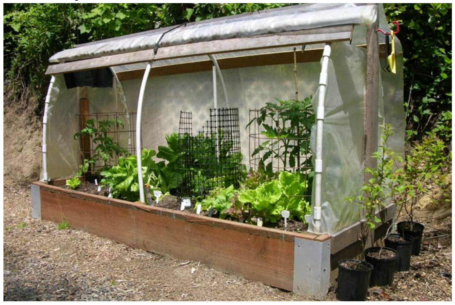
Figure 1. An 8x4-foot cloche used for growing vegetables, Newport, OR.

Archival copy. For current version, see: https://catalog.extension.oregonstate.edu/ec1627 EC 1627-E August 2008