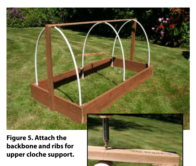
Figure 5 insert. Secure the backbone to the C board and the rib.