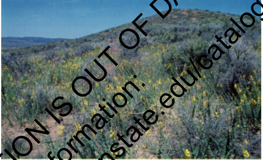
Figure 1.—A typical setting where Dalmatian toadflax invades.

Both species can be found in fields, overgrazed pastures, rangeland, waste areas, and along roadsides (Figure 1). Their wide distribution can be attributed to their use as ornamentals.