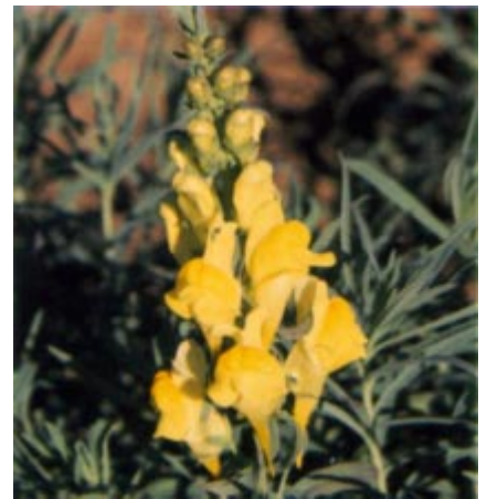
Figure 3.—Flowers of yellow toadflax are similar to those of Dalmatian toadflax.