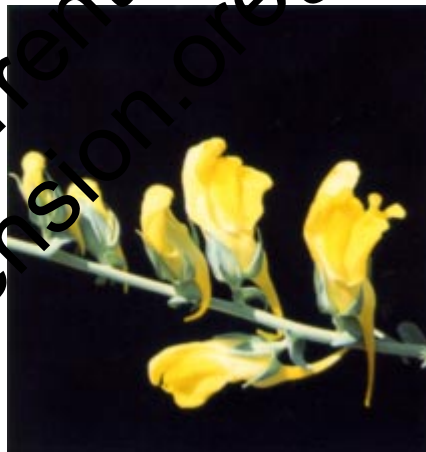
Figure 2.—Flowers of Dalmatian toadflax. Note the long spurs.