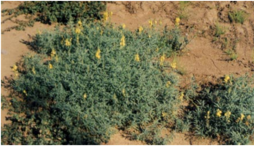
Figure 6.—Yellow toadflax tends to grow in tight clumps.