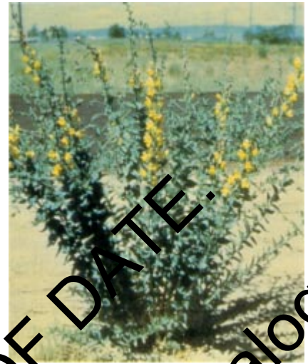
Figure 7.—An individual mature Dalmatian toadflax plant.

Since herbicide registrations change frequently, resulting in more or fewer available herbicides and changes in permissible herbicide practices, this publication doesn't make specific herbicide recommendations. For current information, refer to the Pacific Northwest Weed Control Handbook , published and revised annually by