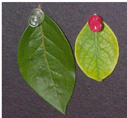
Figure 3. Left: Healthy blueberry leaf. Right: Iron-deficient blueberry leaf. Note the pale green leaf area and contrasting green veins on the iron-deficient leaf. (Photo © Oregon State University. From: Hart, J., D. Horneck, R. Stevens, N. Bell, and C. Cogger. 2003. Acidifying Soil for Blueberries and Ornamental Plants in the Yard and Garden West of the Cascade Mountain Range in Oregon and Washington . EC 1560. Corvallis, OR: Oregon State University Extension Service.)

Guidance on soil acidification for home gardens and small acreages in western Oregon is provided in the following: Acidifying Soil for Blueberries and Ornamental Plants in the Yard and Garden West of the Cascade Mountain Range in Oregon and Washington (EC 1560); Acidifying Soil in Landscapes and Gardens East of the Cascades (EC 1585). For large scale agricultural production, guidance about soil acidification can be found in the following: Acidifying Soil for Crop Production West of the Cascade Mountains (EM 8857); Acidifying Soil for Crop Production: Inland Pacific Northwest (PNW 599). All available in the OSU Extension Catalog ( http://extension.oregonstate.edu/catalog/ ).