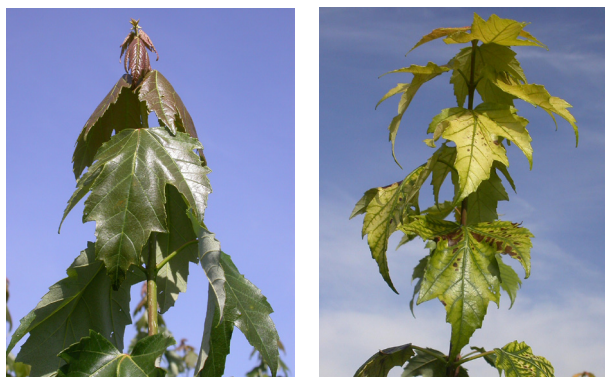
Figure 2. Left: Healthy red maple. Right: Red maple with chlorosis from manganese deficiency. To ensure adequate manganese is available for red maple, the soil pH should be below 5.6 and soil test manganese values should be above 20 ppm. (Photos © Oregon State University. From: Altland, J. 2006. Managing Manganese Deficiency in Nursery Production of Red Maple . EM 8905. Corvallis, OR: Oregon State University Extension Service.)

Details of Mn deficiency, Mn application, and soil pH adjustment can be found in the following publication in the OSU Extension Catalog ( http://extension.oregonstate.edu/catalog/ ): Managing Manganese Deficiency in Nursery Production of Red Maple (EM 8905).