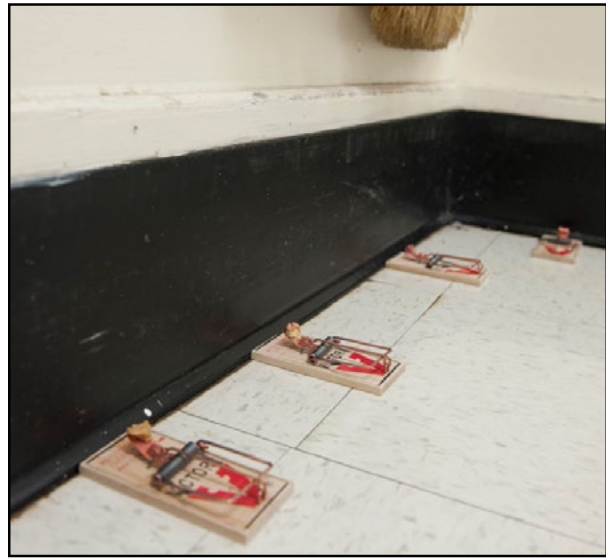
Figure 7. Traps can be baited with a variety of foods. There is no one favorite bait for mice.

Plastic snap traps (e.g., the Kness Snap-E, J.T. Eaton JAWZ, Bell Trapper Mini Rex, Woodstream Quick Kill, etc.) are more durable and can be cleaned with disinfectants more easily. The disposable