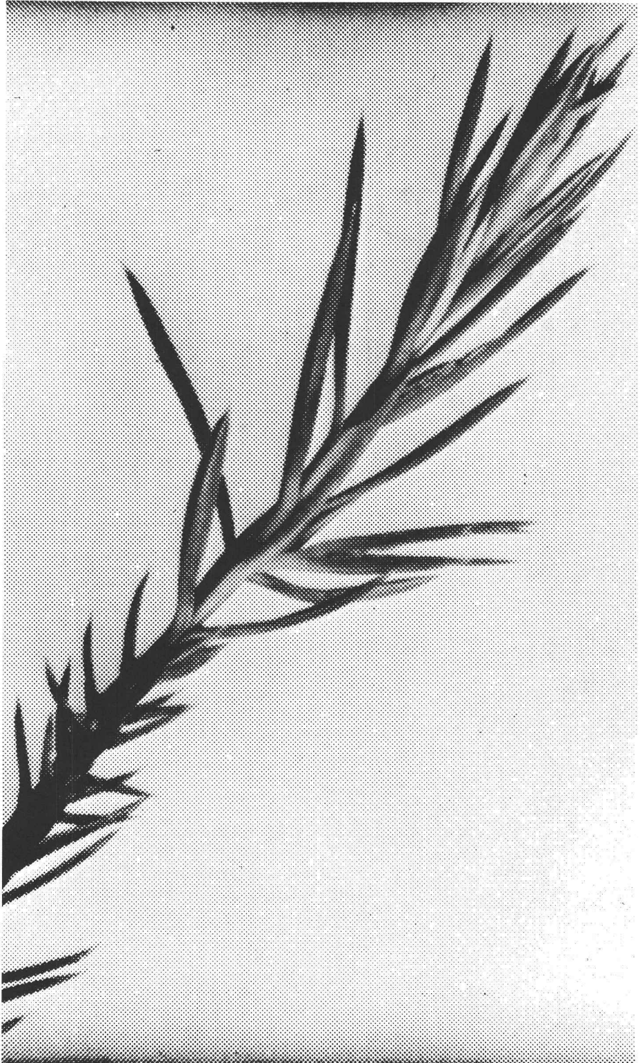
Figure 3—Awl-shaped leaves on a vigorous twig.

Eastern redcedar is very susceptible to damage by the annosus root rot fungus ( Heterobasidium annosum ). This disease is considered to be the species' greatest enemy over much of its range. Cubical rot fungi ( Fomes subroseus and Daedalea juniperina ) and the juniper pocket rot fungus ( F. juniperinus ) may enter redcedar stems through dead branch stubs; therefore, pruning is generally not recommended (fig. 2). In all stages of development, eastern redcedar is susceptible to cedar rusts caused by fungi in the genus Gymnosporangium . Spindle-shaped swellings on the trunks and large branches are one effect of the disease. Witches-broom growths, compact, bushy formations of the foliage, are also caused by a fungus in this genus. Although cedar apple rust fungus ( Gymnosporangium juniperi-virginianae ) infects redcedar, it is rarely fatal; however, this fungus is very damaging to apple trees and is difficult to control. In some States, eradication of all cedars and junipers