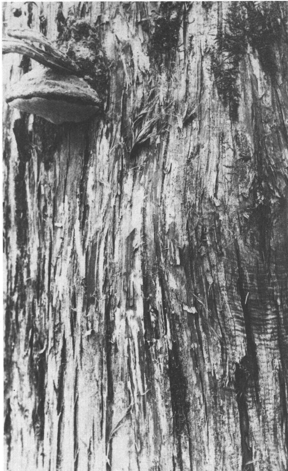
Figure 2—Bark of eastern redcedar and conk of cubical rot fungus, Daedalea juniperina , near branch stub.

The bark is very thin and peels in long, shaggy strips (fig. 2). Radial growth is extremely irregular, and the trunk may be fluted. The tree is variable in form; the crown may be columnar or pyramidal, with the branches ascending, wide-spreading, or even pendulous.