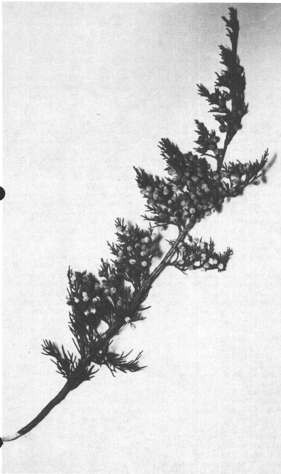
Figure 4—Redcedar fruit and scalelike leaves on a mature twig.

within a mile of an apple orchard is required by law. Redcedar seedlings are susceptible to phomopsis blight ( Phomopsis juniperovora ) and cercospora blight ( Cercospora sequoiae ). Both of these diseases can cause major seedling losses; however phomopsis blight is not serious after the fourth year.