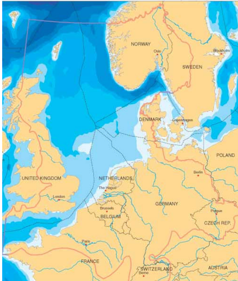
Figure 1: North Sea

The North Sea (ICES sub area IV) is located in the Northeast Atlantic and is mainly bordering by the United-Kingdom, the Netherlands, Denmark and Norway (Fig. 1).