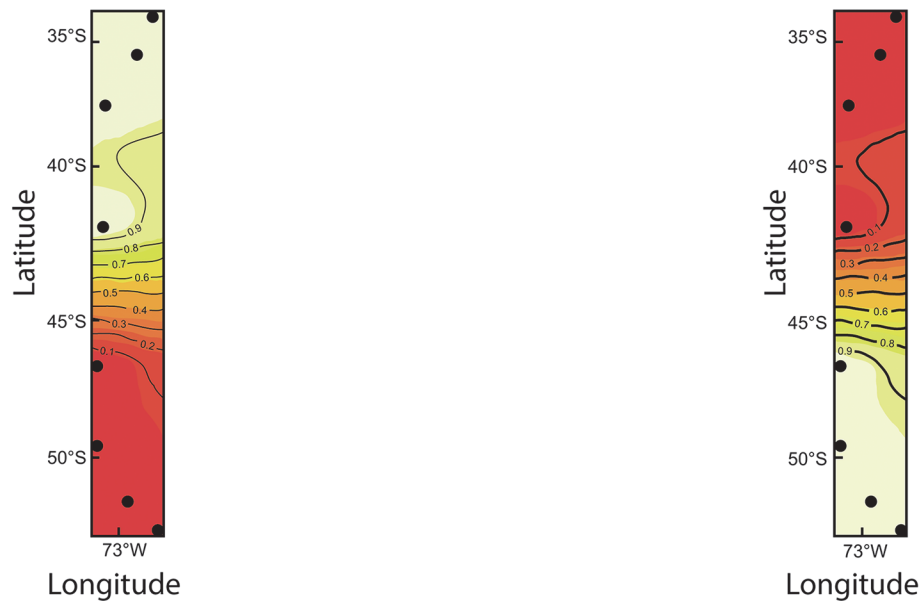
Fig 2. Posterior probabilities of population membership and genetic discontinuities from the spatial model in GENELAND for the Chilean dolphin. Contour lines indicate the spatial position of genetic discontinuities and lighter colors indicate higher probabilities of population membership. Two genetic clusters were identified. Left: North area, right: South area

Posterior probability to belong to South population