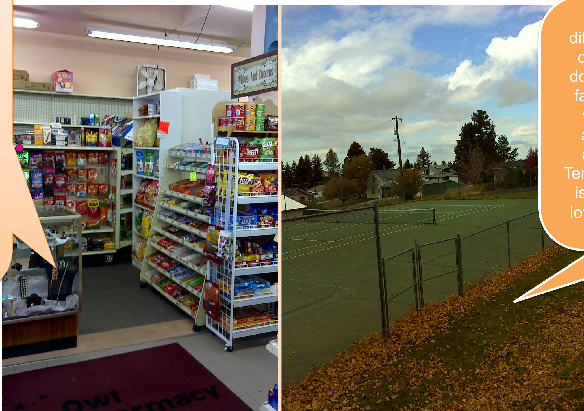
Examples from the Fairfield Community Narrative

Our pharmacy serves as our grocery store, the closest grocery stores are over 15 and 18 and 22 miles away. There is variety of milk, it is 50 cents more per gallon than Costco. Some people don't take into account the cost of going into town. There is not any whole grain bread or noodles. Those who can afford it can order from Royal Produce, the CSA in Tekoa and have produce delivered to home.