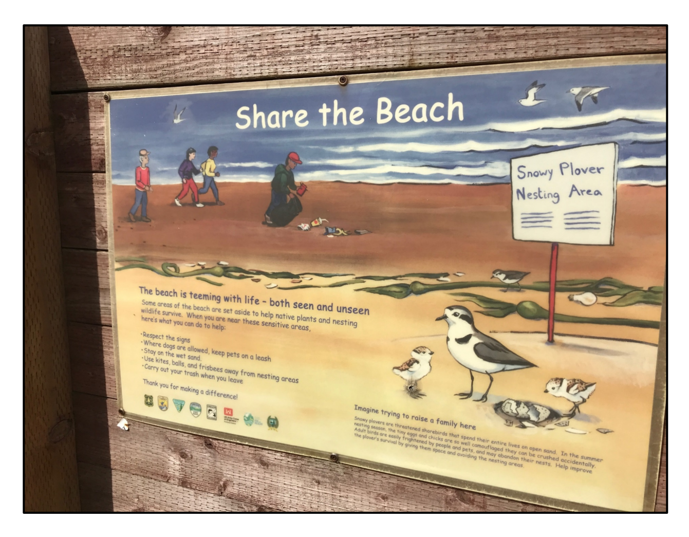
Figure 5. "Share the Beach" sign (control treatment)