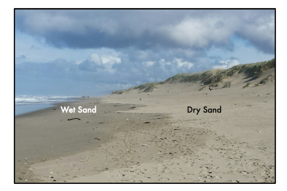
Figure 2. Wet vs dry sand on ODNRA beach. Per ODNRA WSPL restrictions, outdoor recreation was only permitted on the wet sand of Siltcoos Beach during data collection.

There are several existing signs to communicate WSPL beach restrictions to visitors; all of the existing signs were designed and implemented by the U.S. Forest Service (see existing signs in Appendix A). In the parking lot is a trailhead kiosk containing the "Share the Beach" interpretive sign about the WSPL (Figure 5), and the same "Share the Beach" sign is located approximately five meters from the top of the sand dune (see "treatment sign location" in Figure 6). Immediately after passing this sign, visitors are confronted with three additional signs related to WSPL restrictions located at the top of the dune. On the beach, roped fences delineate WSPL nesting habitat. These fences are constructed with yellow rope strung between posts in the sand; on each post is a small yellow sign reading, "Snowy Plover Nesting Area, No Entry Beyond This Point, March 15- September 15." Generally, the fenced area extends from the elevated sand dunes to the upper high tide line. Although dry sand outside the rope is also closed during the WSPL nesting season, it is not possible to fence it given the daily change in ocean tides. In addition to signs, several volunteer docents communicate information about the WSPL to