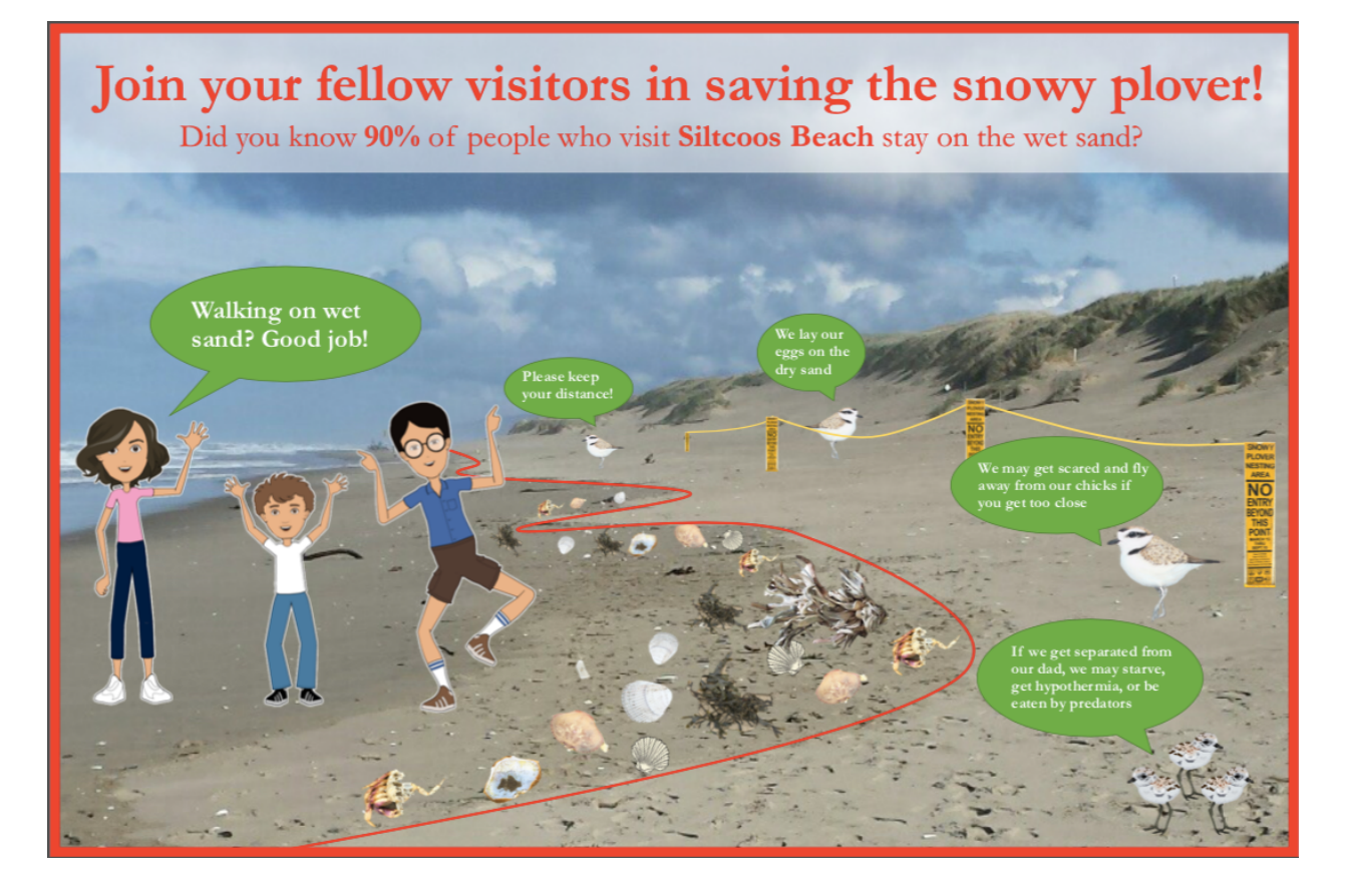
Figure 3. Normative sign