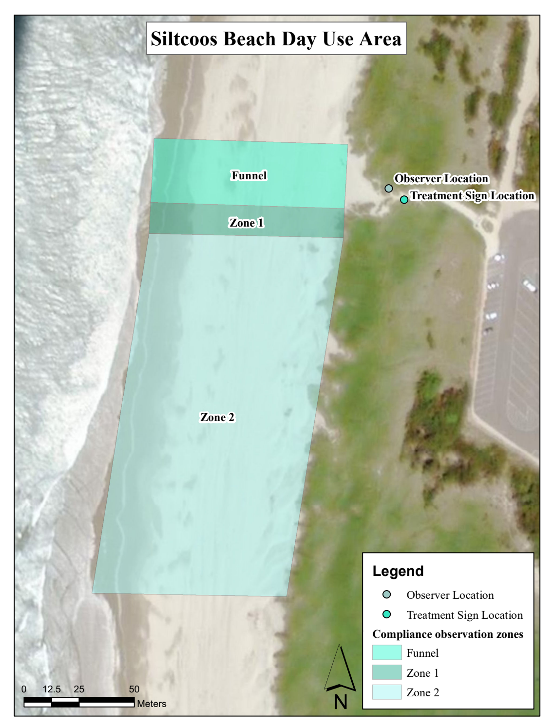
Figure 6. Siltcoos Beach Day Use Area map. Snowy plover recreation restrictions were not enforced north of the funnel zone.