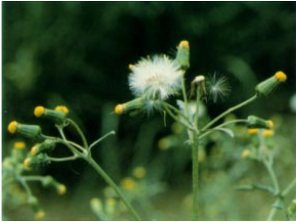
Figure 2. — The flower heads are \frac{1}{4} to \frac{1}{2} inch long, with yellow disk flowers and black-tipped bracts around the base. Seeds are carried on the wind by a tuft of silky white hairs.