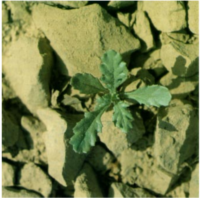
Figure 3. — A seedling plant of common groundsel.

have the same mode of action in the same field year after year.