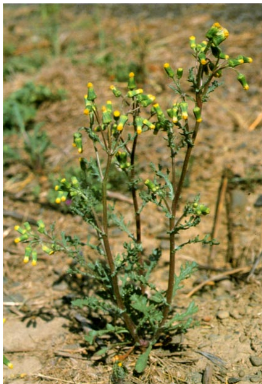
Figure 1.—Common groundsel grows from 4 to 18 inches tall. Leaves are deeply lobed with toothed margins. The lower stems and undersides of basal leaves usually are purplish-colored.

Poisoning occurs most commonly in situations where animals cannot separate out the toxic plants—when they are mixed with the forage in a pasture, or when they are fed in hay or silage. The liver disease is chronic and progressive, resulting in death months later in most animals, with few or no