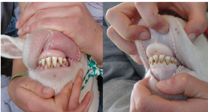
Figure 2. Comparison of the gums of a normal sheep (left) and a sheep with severe anemia due to a high burden of stomach worms (right).

Treatment should be adjusted to the worm burden. When the burden is very high, killing all parasites at