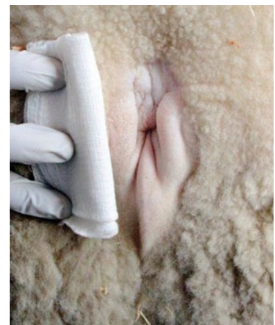
Figure 3. Pale perineum in a sheep with severe anemia due to a high burden of stomach worms. A white gauze is shown for color comparison.