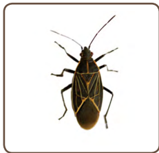
Boxelder bug Boisea rubrolineata