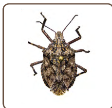
Rough stink bug Brochymena sulcata