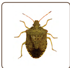
Conspense stink bug Euschistus conspersus