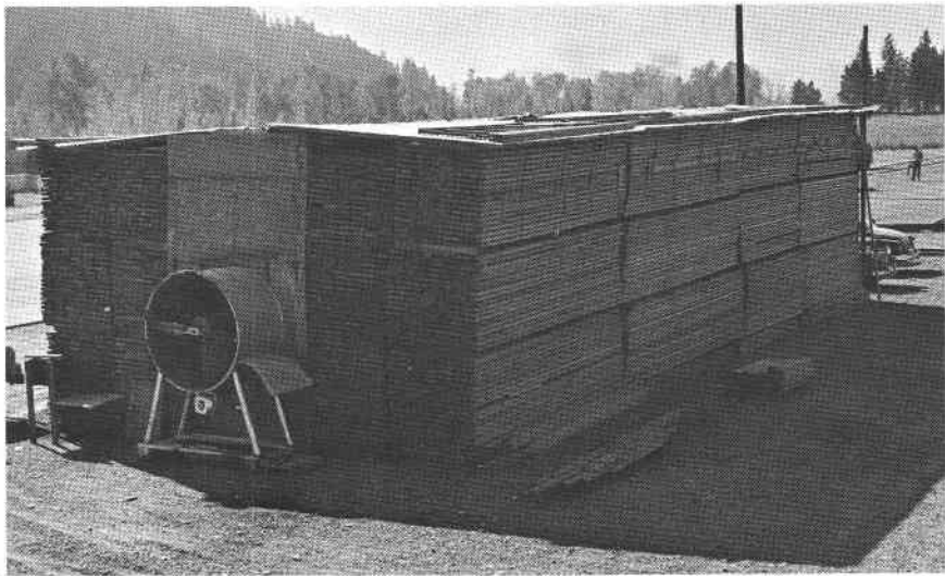
Figure 2. Dimension lumber of Douglas fir ready to be dried with forced circulation of air.