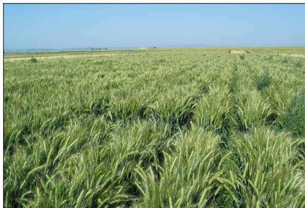
Figure 3. Production of ORSS-1757 (in headrows) for seed.

Average break flour yields for ORSS-1757 were higher than those for Stephens and Tubbs 06, and the milling score for ORSS-1757 was superior to that for Tubbs 06 and similar to that for Stephens. Flour protein content for ORSS-1757 was lower than that for Stephens and similar to that for Tubbs 06. Mix absorption of ORSS-1757 was similar to that of Tubbs 06 and 0.9% less than that of Stephens. The average cookie spread for ORSS-1757 was 0.3 centimeters greater than that for Stephens and Tubbs 06.