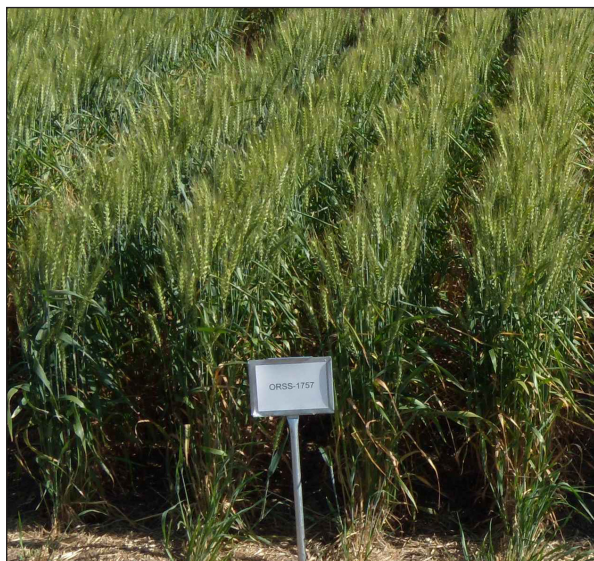
Figure 2. ORSS-1757 wheat.