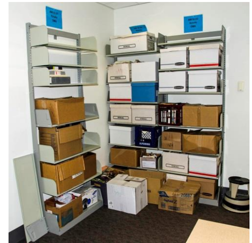
Ready for Processing!