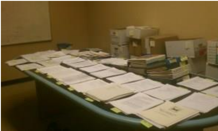
Lots of Post-It Notes