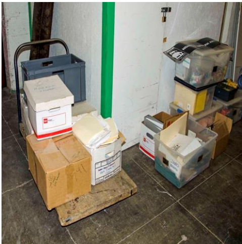
Pick Up at a Portland Storage Unit