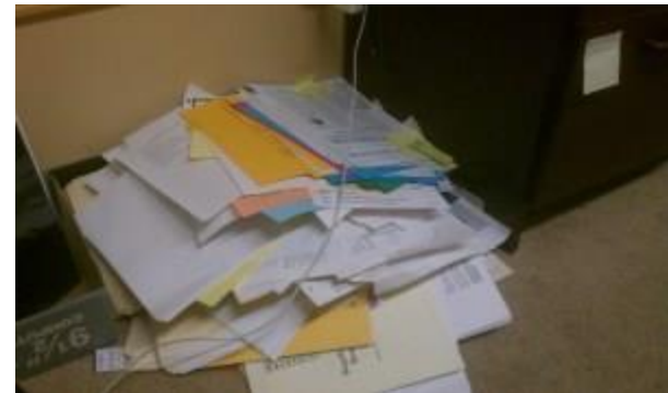
Lots of Weeding