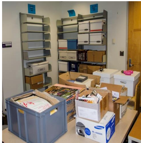
Transfer to the OMA