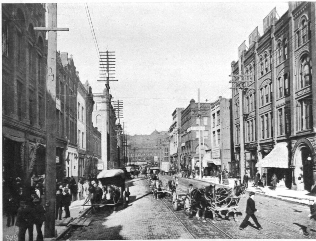
FIRST AVENUE, LOOKING SOUTH