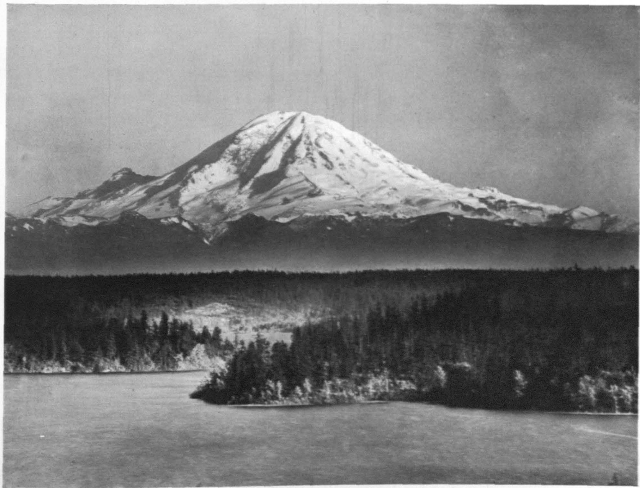
MOUNT RANIER FROM LAKE WASHINGTON