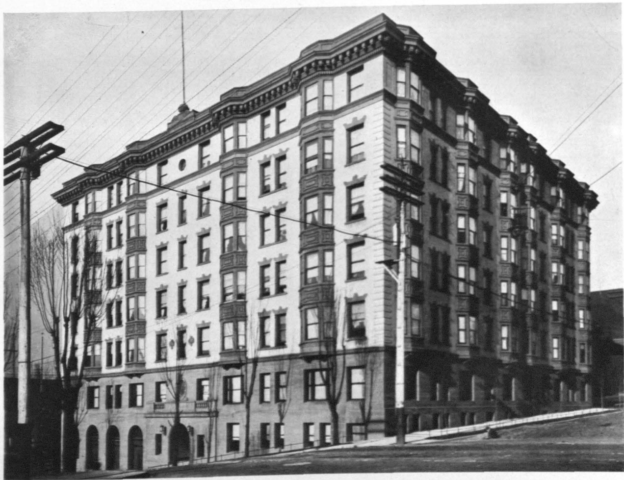
THE LINCOLN APARTMENT HOUSE