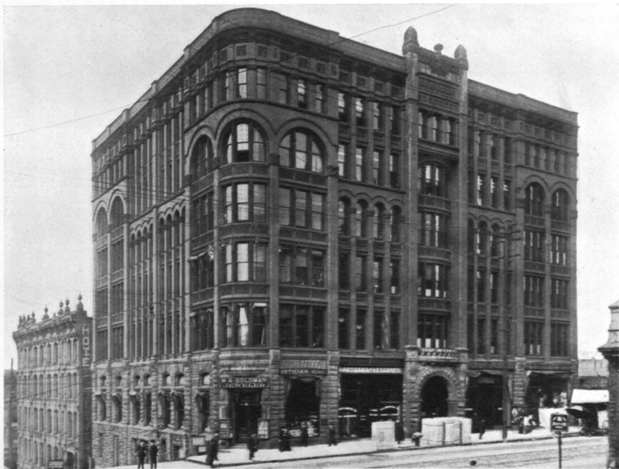
THE BURKE BUILDING