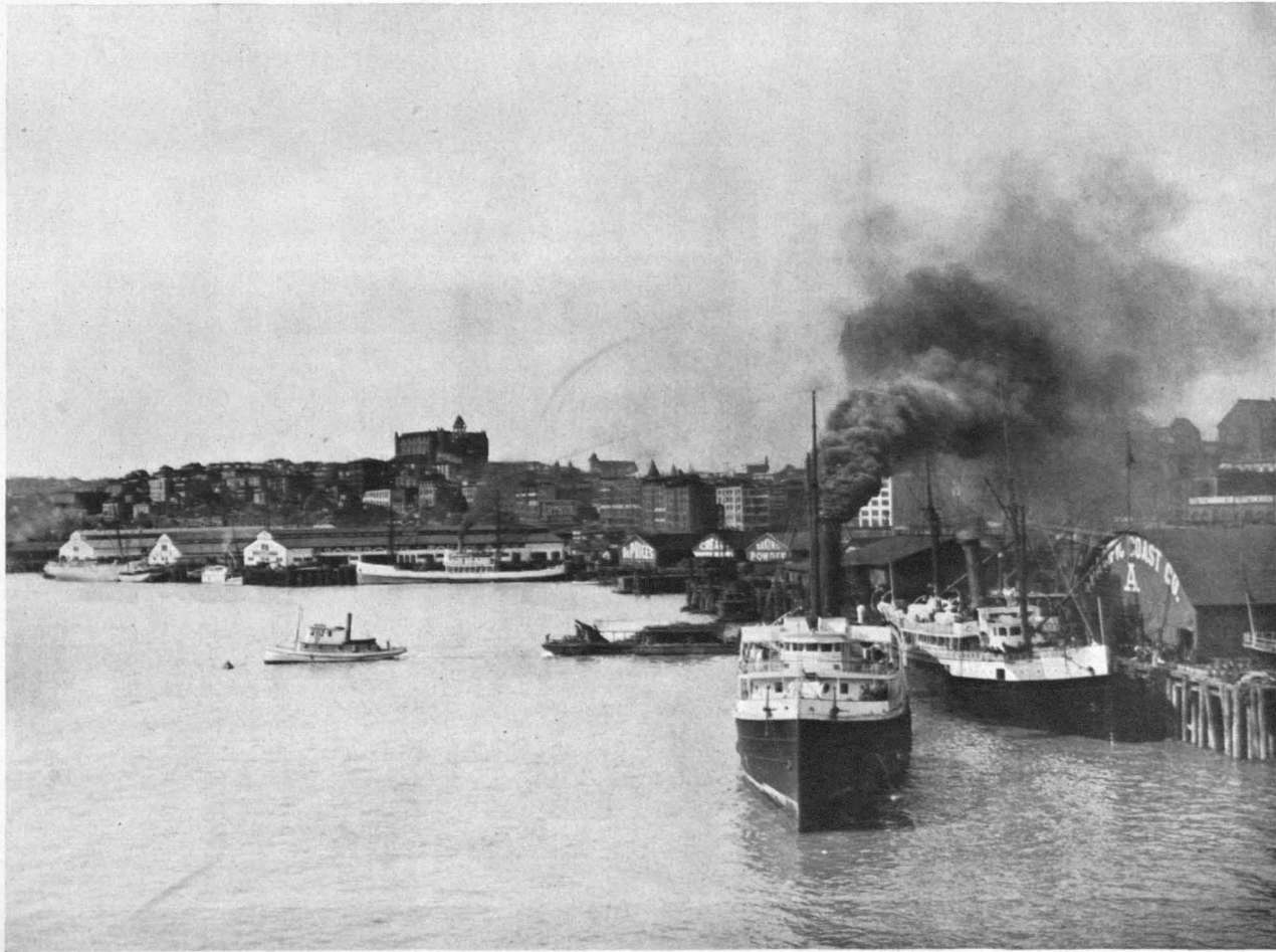
VIEW OF SEATTLE'S WATER FRONT FROM HARBOR