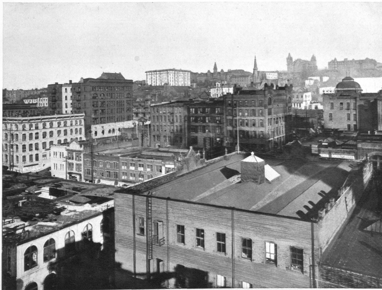
A GLIMPSE OF THE BUSINESS SECTION