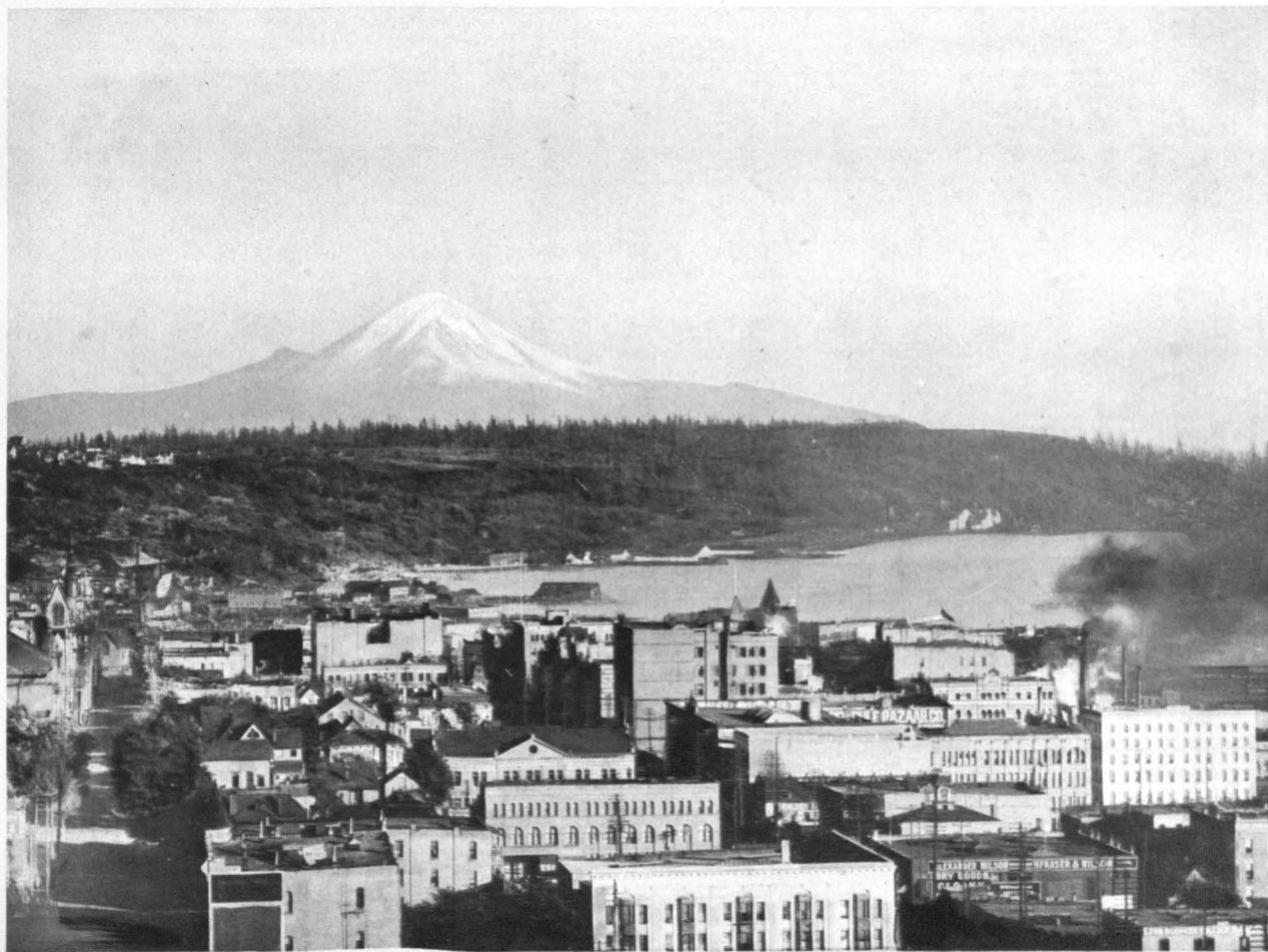
MOUNT RANIER, FROM SEATTLE