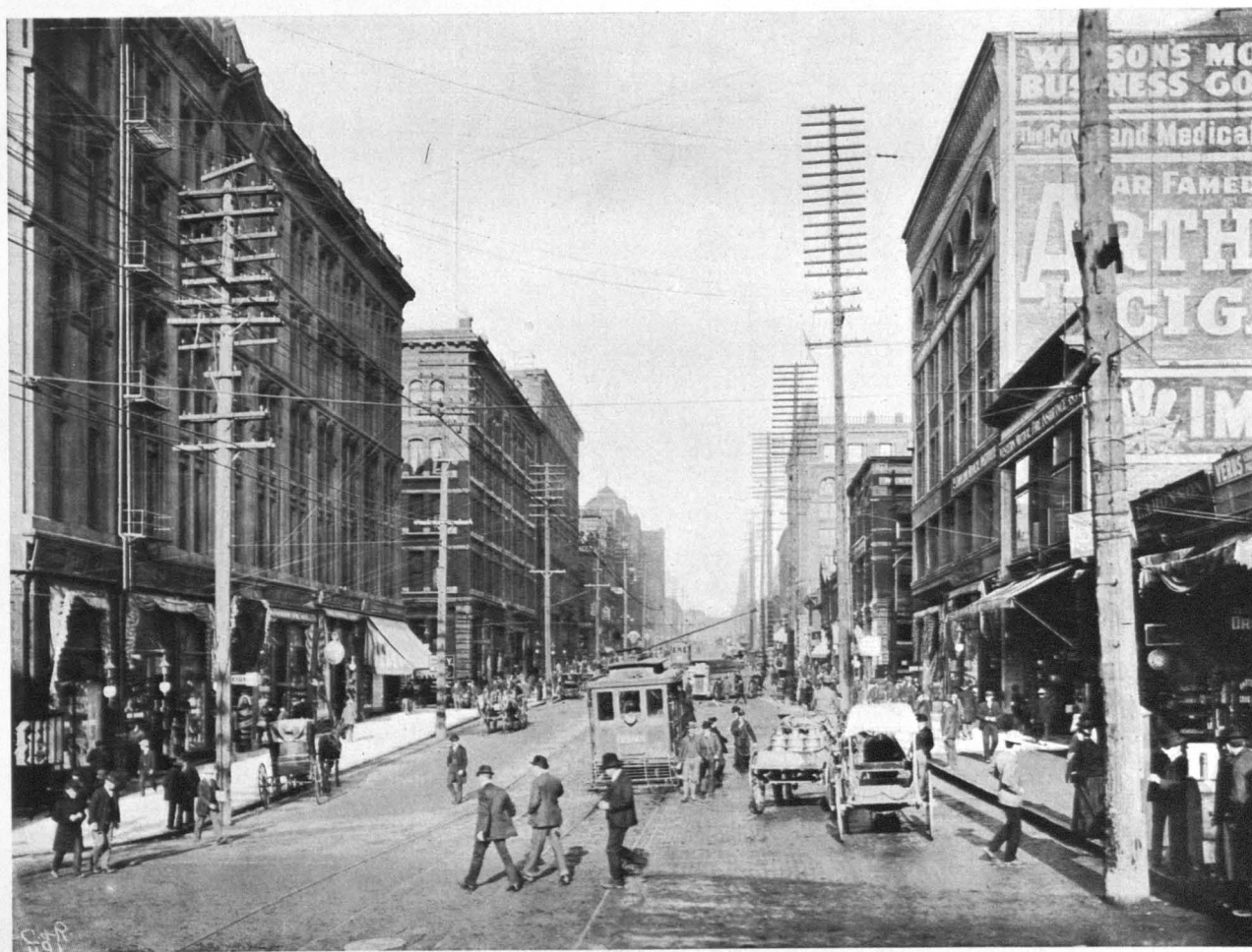
SECOND AVENUE, LOOKING NORTH