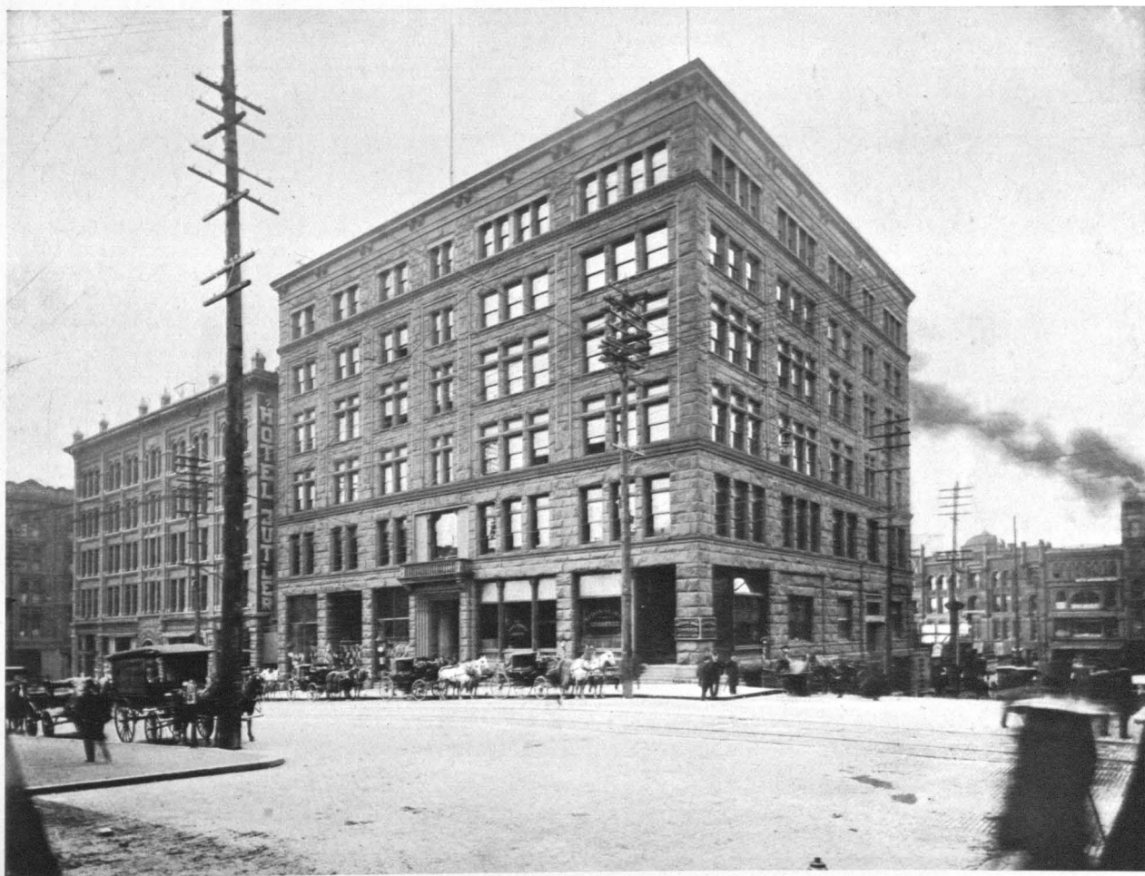
THE BAILEY BUILDING