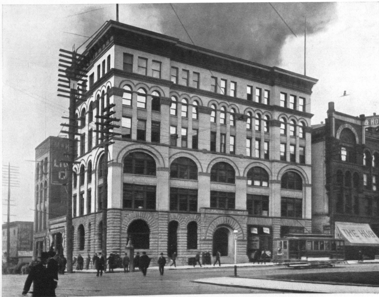
THE MUTUAL LIFE BUILDING