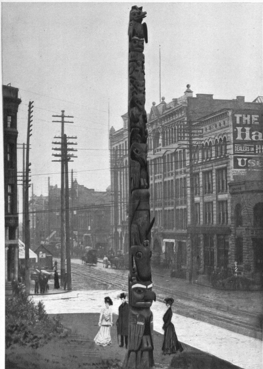
ALASKA TOTEM POLE, PIONEER SQUARE