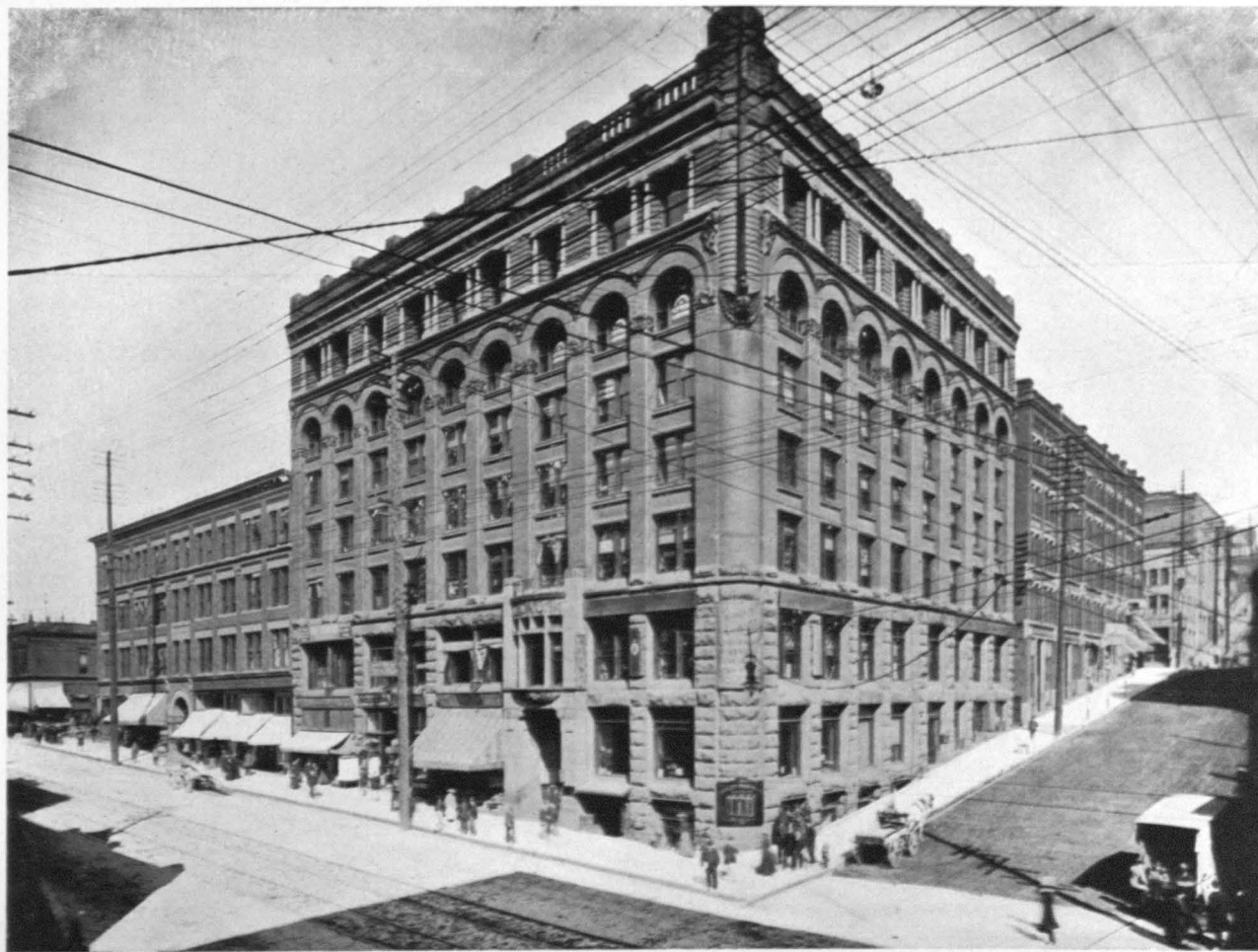
NEW YORK BLOCK, CORNER SECOND AVENUE AND WEST CHERRY STREET