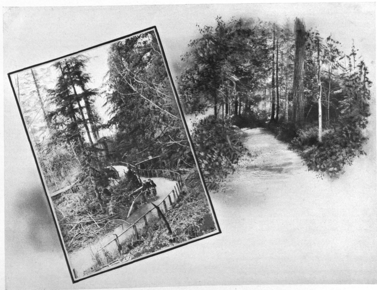
BICYCLE PATHS—SUBURBS OF SEATTLE