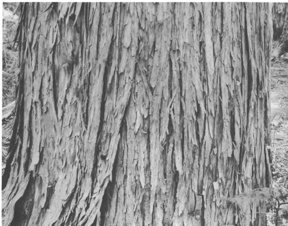
Figure 2—Bark of Alaska-cedar.

Growth is especially slow at timberline, and trees may resemble sprawling