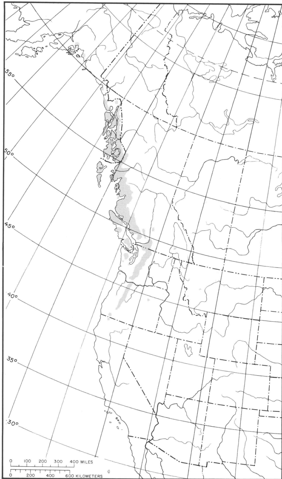
Figure 1—The natural range of Alaska-cedar.

Alaska-cedar occasionally grows in pure stands but usually singly or in scattered groups mixed with other tree species which change with latitude. Alaska-cedar may be found with the