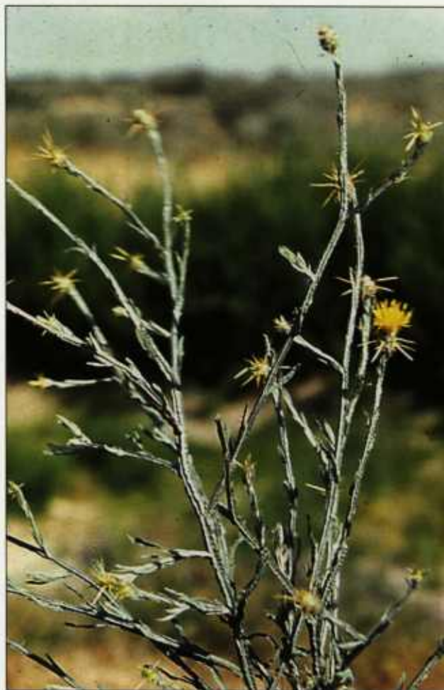
Yellow starthistle seedling (top) and mature plant (bottom).