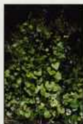
Garlic mustard plants (photo courtesy of John M. Randall, The Nature Conservancy).

Plants form basal rosette of kidney-shaped leaves in the first year, with a flower stalk elongated in the second year. Upper leaves are alternate on stem and triangular in shape. Leaves produce a distinct garlic odor when crushed. Single flower stem with white flowers produced in second year.