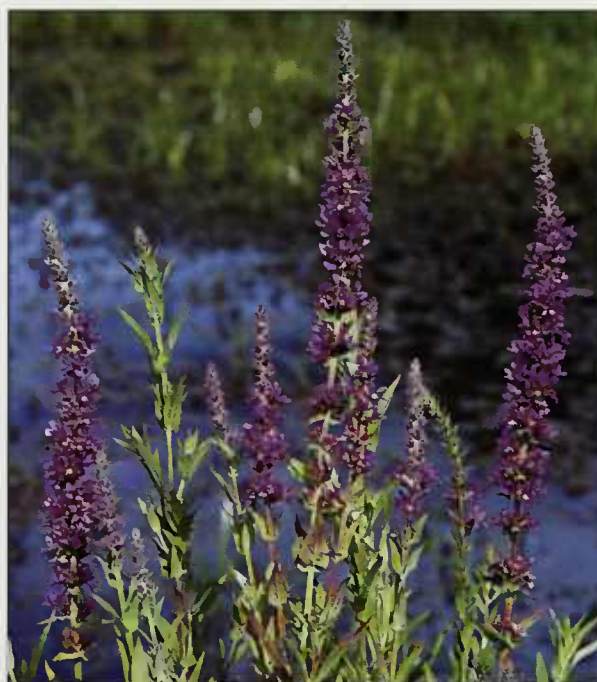
Purple loosestrife seedling (top) and flowering plants (bottom).