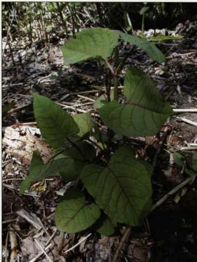
Japanese knotweed seedling.

Burning: Often impractical due to plant location.