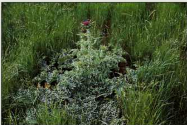
Blessed milkthistle seedling (top) and mature plant (bottom).