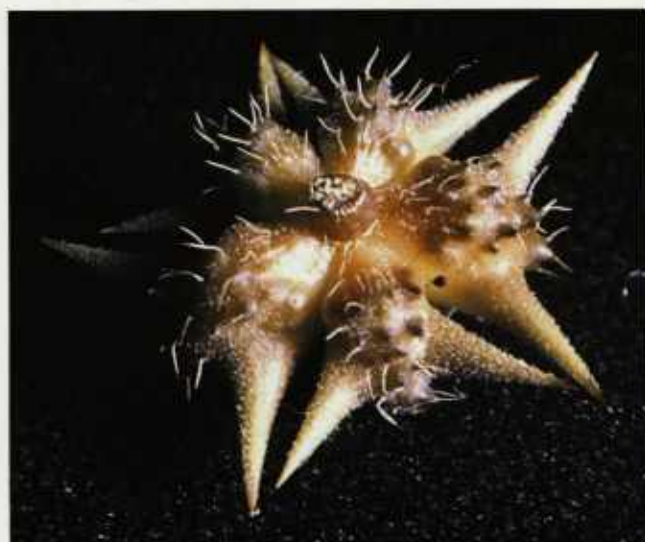
Puncturevine seedling (top), mature plant (middle), and spiny seed capsule (bottom).