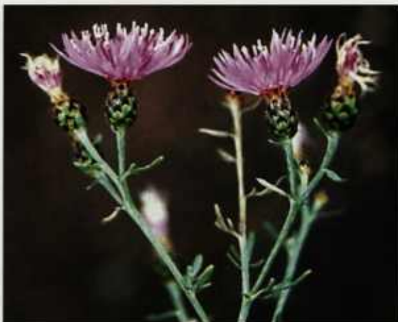
Spotted knapweed rosette (top) and flowers (bottom).

Manual removal: Ineffective or impractical with large populations.