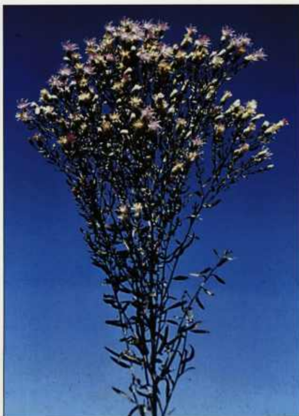
Russian knapweed seedling (top) and mature plant (bottom).

Biological control: Two agents can be moderately effective when combined: Subanguina picridis , a gall-forming nematode, and Aceria acroptiloni , a seed gall mite.