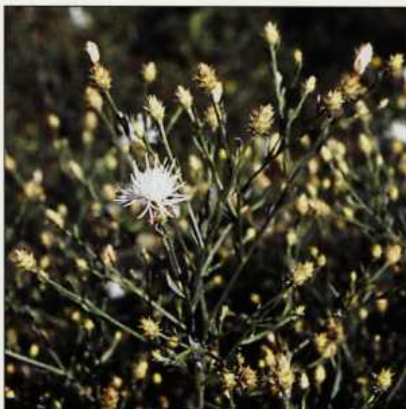
Diffuse knapweed rosette (top) and mature flowering plant (bottom).