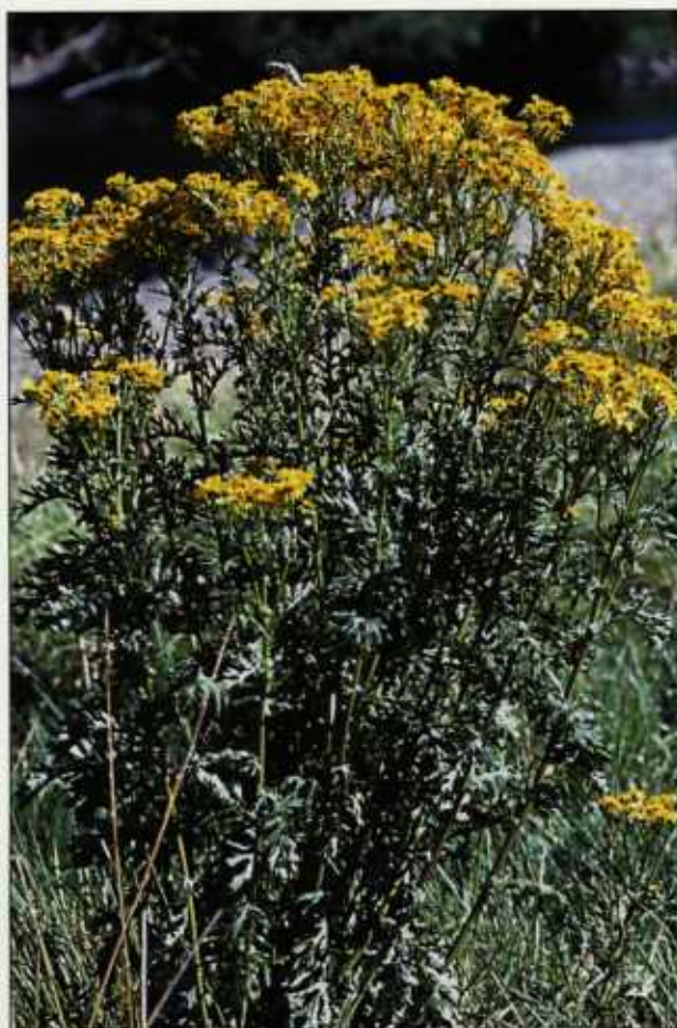
Tansy ragwort seedling (top) and mature plant (bottom).

Manual removal: Moderately effective with low populations.