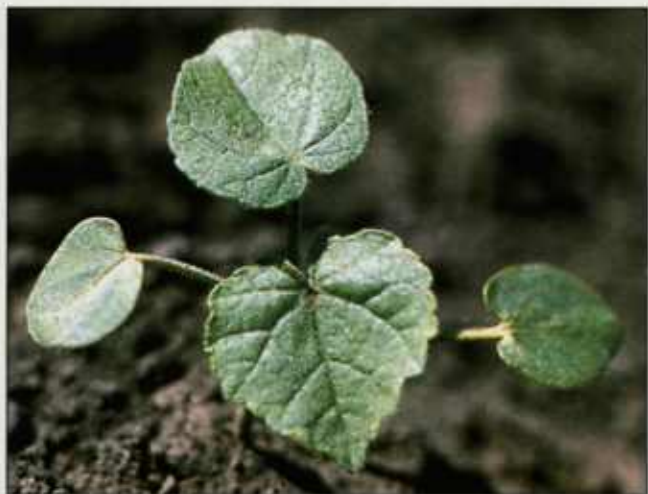
Mature velvetleaf plant with disk-shaped seed capsules (top), flowering plant (middle), and seedling (bottom).