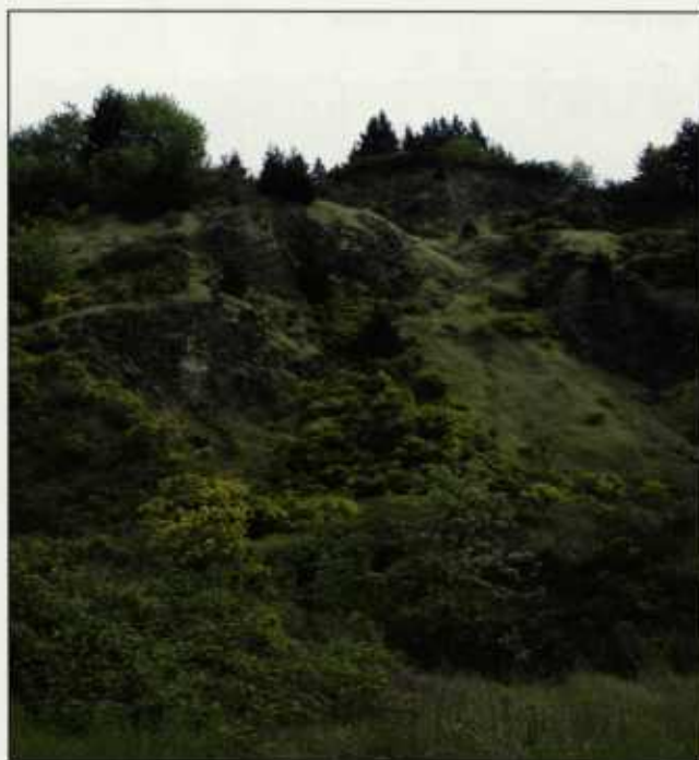
Top: French broom (left) and Scotch broom (right). Bottom: Mixed Scotch and French broom infestation near Eugene, Oregon.

sunlight. South and east of the Cascades, their spread is limited by low precipitation. They are adaptable to many sites, including pastures, cultivated fields, roadsides, waterways, and recently logged lands. Plants reproduce both vegetatively and by seed. Seeds are dispersed by wind and an explosive opening of pods,