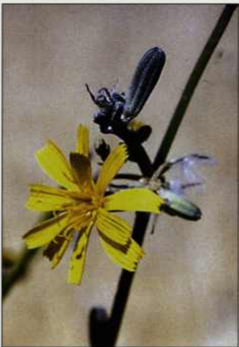
Rush skeletonweed seedling (top), rosette (middle), and flower (bottom).

Manual removal: Pulling plants is effective in small populations and during seedling stages. Areas opened by plant removal should be immediately seeded with desirable species to suppress future rush skeletonweed seedlings. Pulled established plants should be burned to prevent regrowth from root pieces.