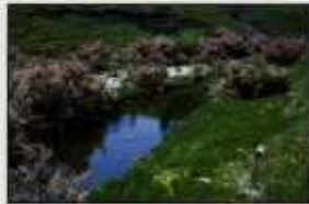
Tamarisk flowers (top,) and infestation (bottom,).