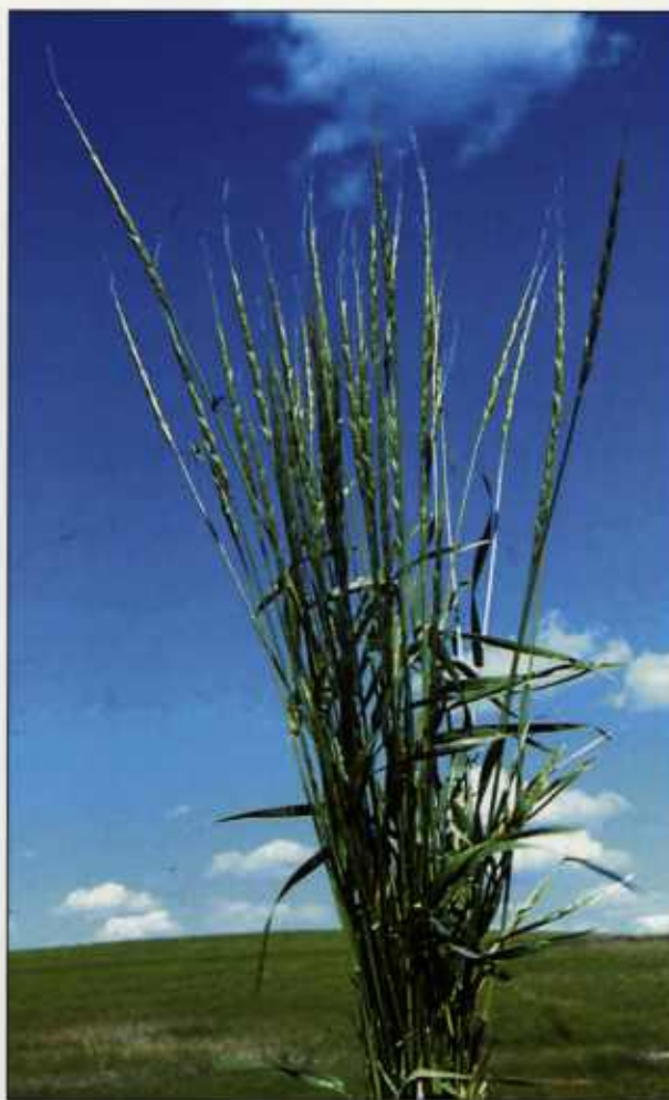
Mature jointed goatgrass plant.

Jointed goatgrass causes severe yield and crop quality losses in winter wheat. Five jointed goatgrass plants per square foot reduce wheat yield by about 25 percent in Oregon studies. Jointed goatgrass will hybridize with wheat. Hybrid seed is difficult to clean from wheat seed and can result in significant crop dockage.