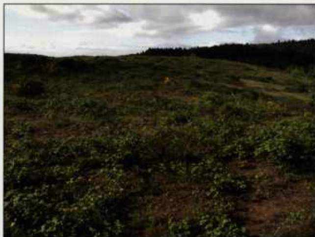
Himalayan blackberry fruit (top), plants (middle), and landscape view of extensive invasion near Corvallis, Oregon (bottom).