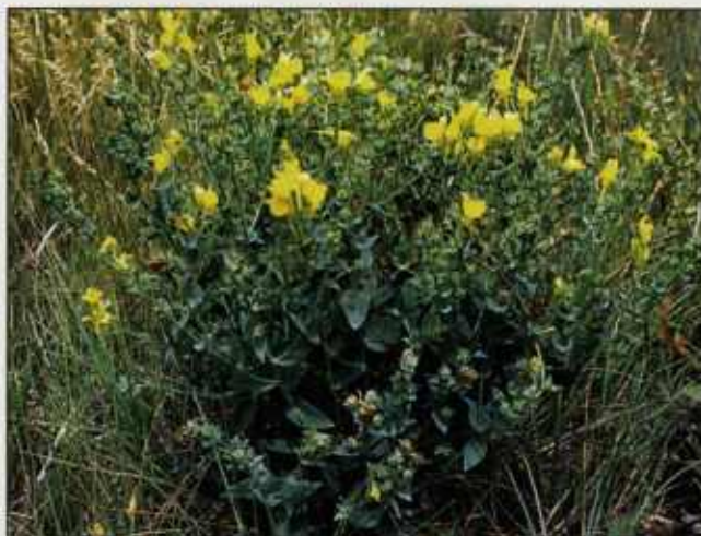
Dalmation toadflax seedling (top) and mature plant (bottom).