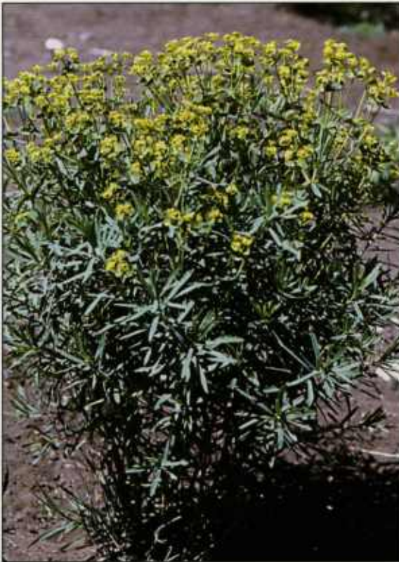
Mature leafy spurge plant.