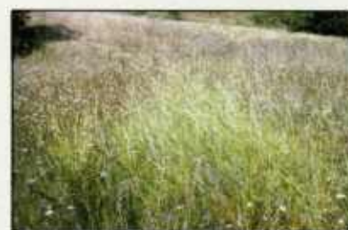
False brome plant (top) and dominated landscape (bottom).