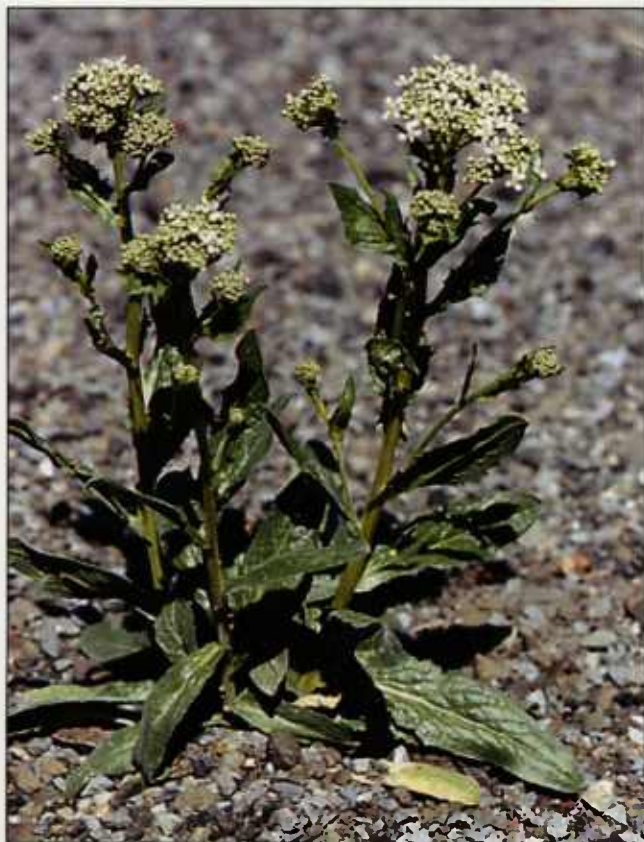
Hoary cress plant.

Native to southwest Asia. Hoary cress was most likely introduced in ship's ballast or alfalfa seed in the 1870s. Whitetop was introduced in alfalfa seed from