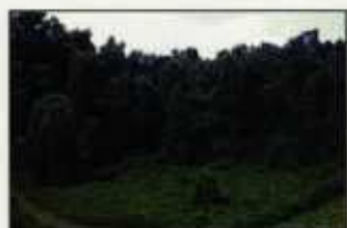
Kudzu infestations dominate a forest.

Burning: Burning in spring in forested areas prior to herbicide treatment can be an important tactic in an integrated management program.