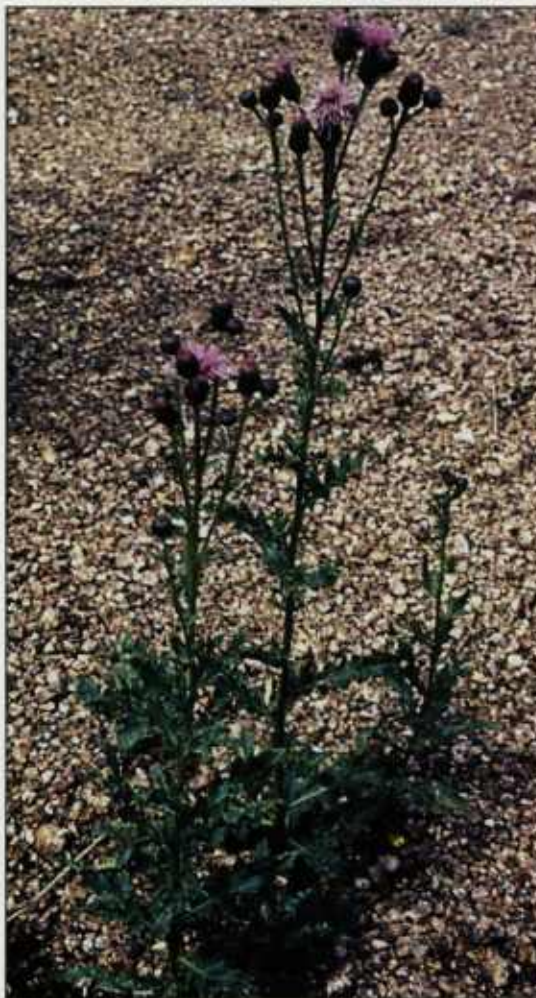
Canada thistle seedling (top) and mature plant (bottom).