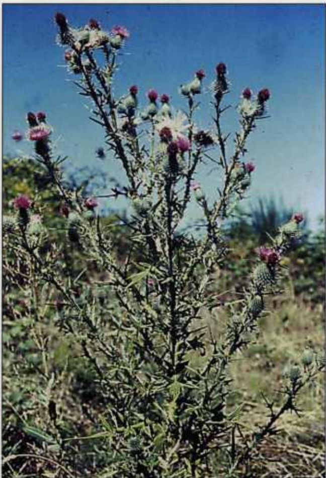
Bull thistle seedling (top) and mature plant (bottom).

winged at attachment to stem. Multiple stems reach up to 6 feet tall, terminated with a single rose to purple flower.