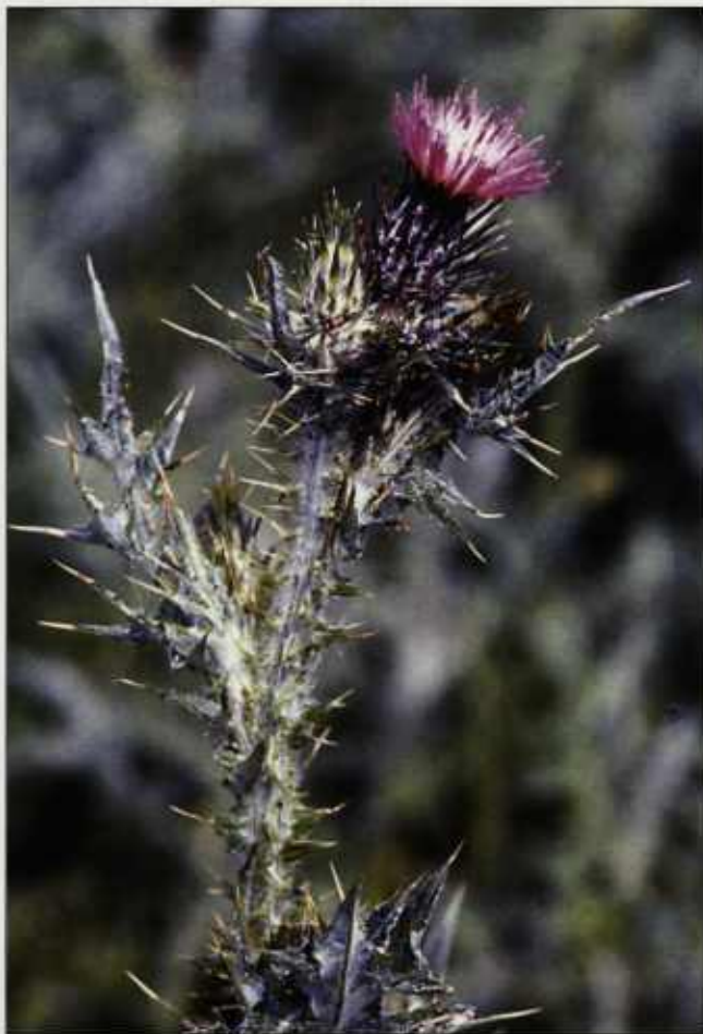
Italian thistle seedling (top) and mature plant (bottom).