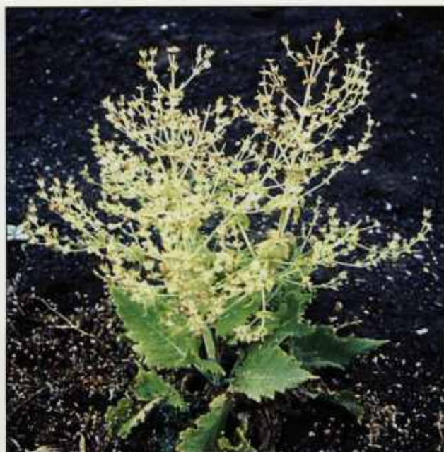
Seedling (top) and mature (bottom) Mediterranean sage plant.

seeds. Seeds are dispersed as plants tumble across the ground, and in hay or on farm equipment.