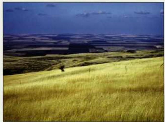
Downy brome plant (top) and landscape dominated by downy brome invasion near Pendleton, Oregon (bottom).