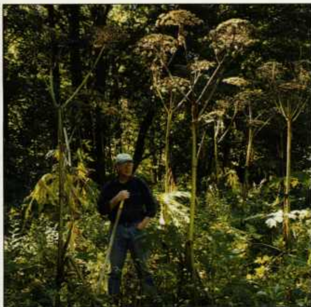
Giant hogweed infestation (photo courtesy of Elizabeth Colquhoun).