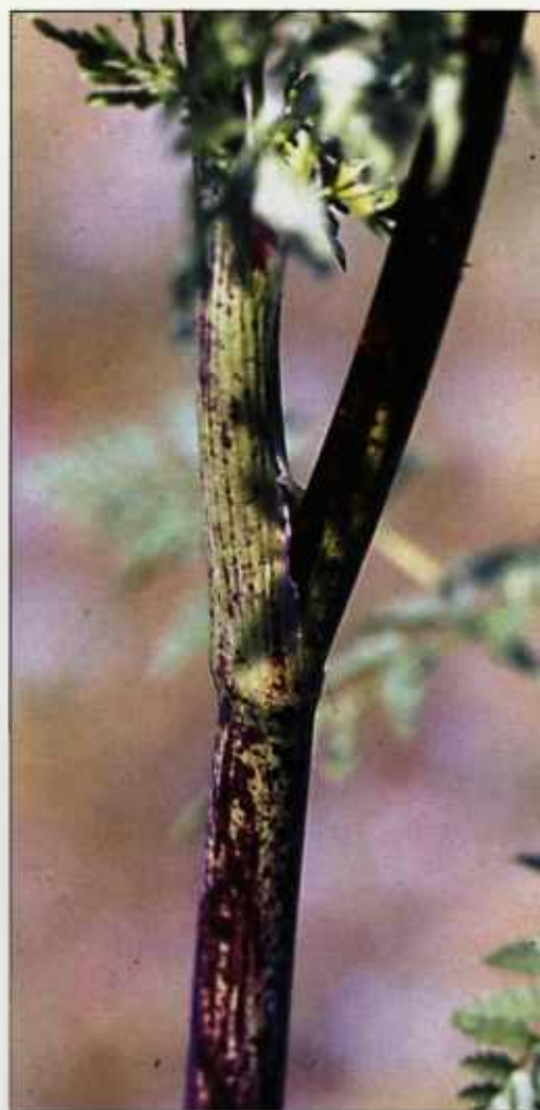
Poison hemlock stem with distinctive red to purple spotting.

Herbicides: Effective herbicides include: