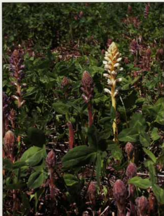
Emerged small broomrape flower stalks in a red clover field in the Willamette Valley, Oregon.

Small broomrape is a native of Europe, the Mediterranean, and North Africa. In North America, it was first documented in California in 1838. Small broomrape introduction routes are largely unknown, but likely involve contaminated crop seed and equipment.