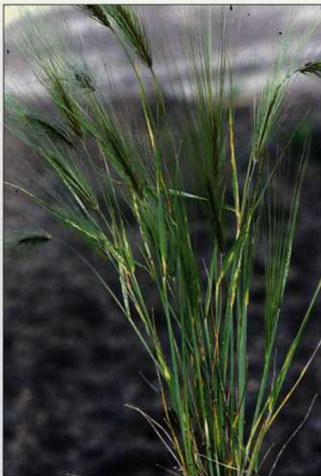
Mature medusahead plant.