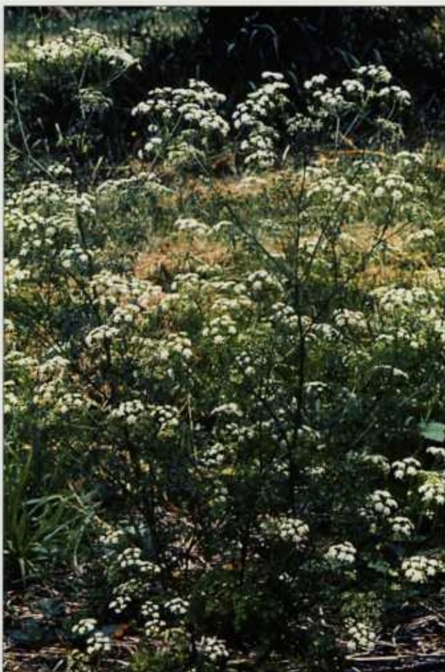
Poison hemlock seedling (top) and mature plants (bottom).