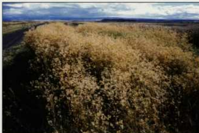
Perennial pepperweed infestation (photo courtesy of Michael Carpinelli).

Displaces native vegetation and reduces crop yield, particularly in sugar beet and alfalfa. Perennial pepperweed has a low protein content and