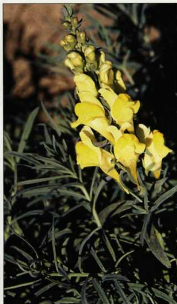
Yellow toadflax seedling (top) and mature plant (bottom).

Herbicides: Effective herbicides include: