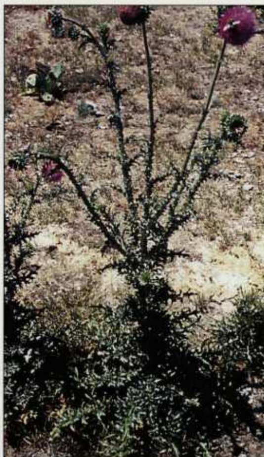
Musk thistle seedling (top) and mature plant (bottom).