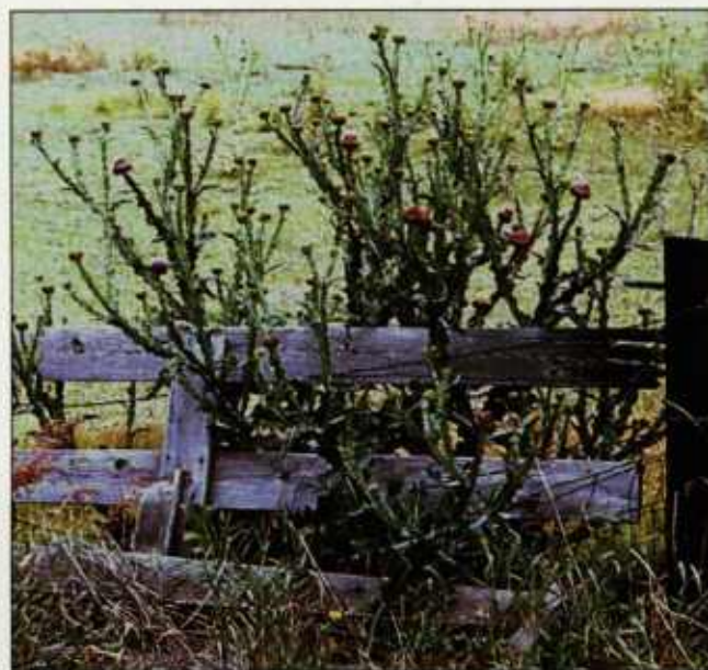
Scotch thistle seedling (top) and mature plants (bottom).