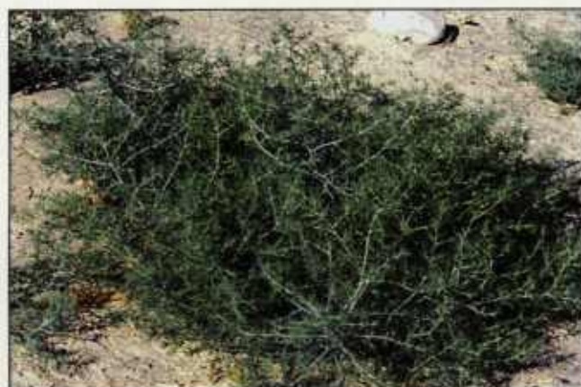
Russian thistle seedling (top) and mature plant (bottom).