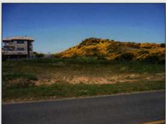
Spiny gorse stem and modified leaves (top) and infestation near Bandon, Oregon (bottom).