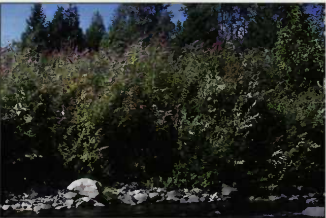
Butterfly bush infestation along the McKenzie River in Oregon.