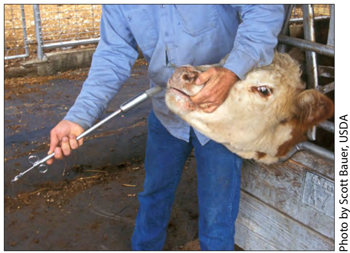
Animal technician administers a bolus to a cow.

Feed supplemented with Se can also be utilized in livestock diets. However, it is important to know whether the Se supplement is inorganic or organic. Animals that consume organic Se retain more Se, and there are fewer concerns about toxicity. Feeding Se-fortified feed can provide a more consistent intake of Se.