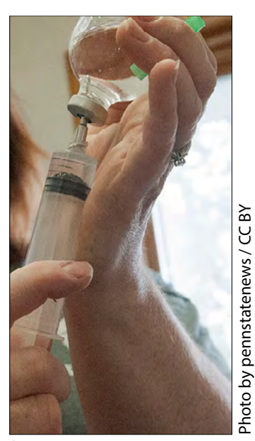
Preparing an injection.

Different concentrations of injectable, inorganic Se are available for different kinds of animals. Be sure to follow label recommendations; overdosage can be toxic to animals.