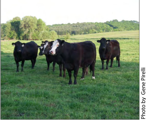
Se used as a fertilizer can increase Se concentrations

A pelleted material from New Zealand (called Selcote Ultra) contains sodium selenite that is 4.5 grams of actual Se per pound. This product is approved for use in Oregon by the ODA and can only be mixed with fertilizer by a licensed fertilizer dealer. Recommended application rates of Selcote Ultra are 1 to 2 pounds per acre. Late winter or early spring applications are most effective; however, there