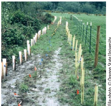
Figure 23. Riparian buffer installed next to a farm field. A stream is at left, outside the photo frame. In this case, livestock fencing (at right in photo) is essential to the success of the buffer planting.

Deer and elk can jump easily over livestock fencing, so 8-foot or higher fencing is needed to protect plants from these animals. This can be prohibitively expensive; individual tree protectors often are used instead. An 18-inch-high chicken wire fence placed between the stream and planted stock keeps out most beaver and nutria.