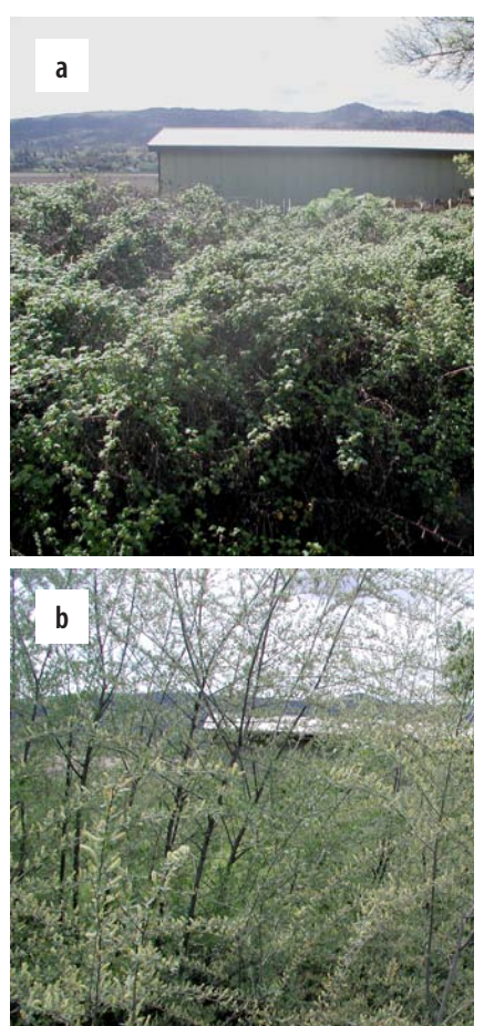
Figure 22. Two seasons after Himalayan blackberry was cut back on this site (a), sandbar willow has made a good recovery (b).