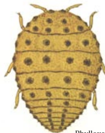
Phylloxera as depicted by the Swiss biologist and entologist Dr. Otto von Schneider-Orelli (1880–1965). Enlarged 66x.

Proper sanitation may reduce the risk of phylloxera infestation (see OSU Extension publication EC 1463), but it is no guarantee against its spread. The potential economic loss from phylloxera infestation is so great that planting on resistant rootstocks is recommended even in regions where phylloxera is not yet present.