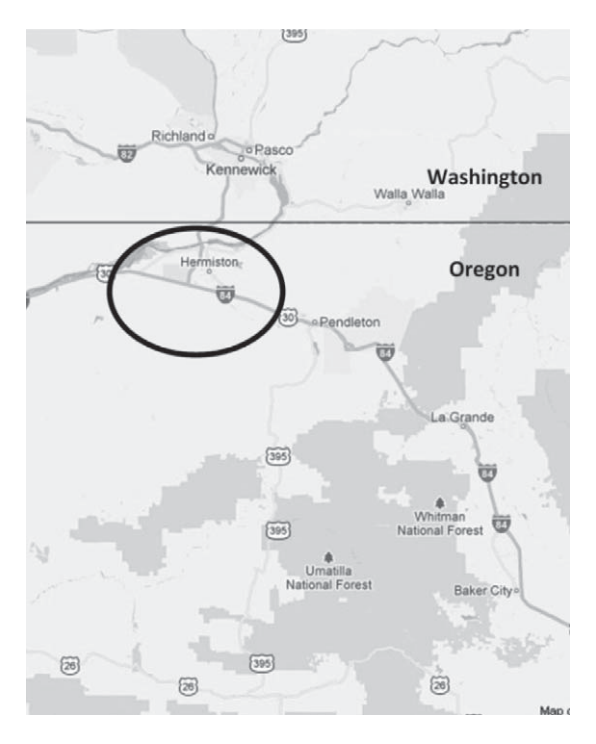
Fig. 1. Map of eastern Oregon. The lower Columbia basin is one of the richest irrigated agriculture areas in the world. Circle shows the area where field plots were located (N 45.8411° W 119.2917°; N 45.8356° W 119.6992°).

In 2007 and 2008, ground beetles were surveyed in first yr commercial organic (n = 3) and conventional potato fields (n = 4) in the Boardman and Hermiston area located east of the Cascade Mountains in Oregon (Fig. 1). Insects were collected with pitfall traps; pitfall traps are widely used to collect soil arthropods in both agricultural and natural systems (Southwood 1978; Adis 1979; Weeks et al. 1997; Hansen & New 2005; O'Rourke et al. 2008). Ten pitfall traps per field were placed in a linear transect; traps were 15.2 m apart. Traps were placed in the rows to prevent flooding from irrigation. Typically potatoes are hilled, creating deep furrows between rows, and thus