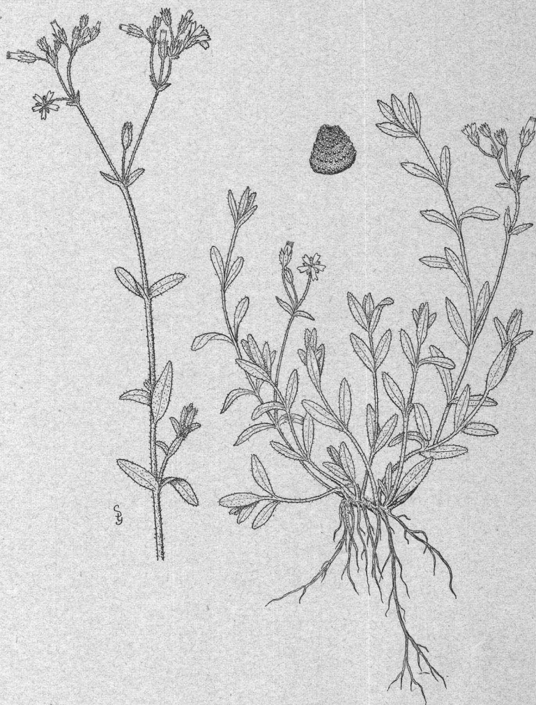
COMMON MOUSE-EAR CHICKWEED— Cerastium vulgatum —Showing entire plant with roots, individual stem with flowers, and seed. Seed enlarged 18 diameters.

There are several methods of controlling the pest in lawns. It is reported that dusting the plants thoroughly with superphosphate will kill them. Sodium