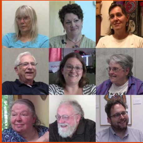
OSQA Oral History Interviewees