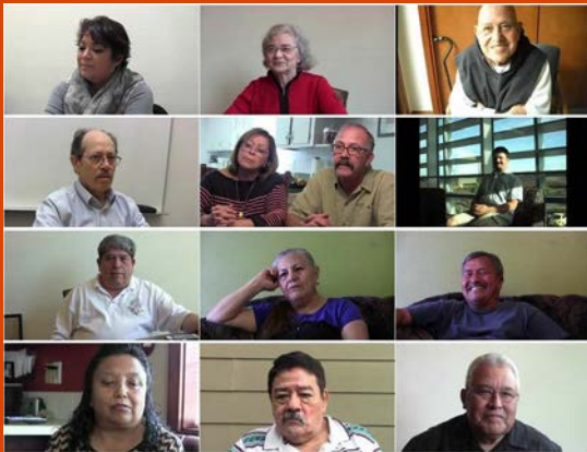
Latinos en Oregon Interviewees