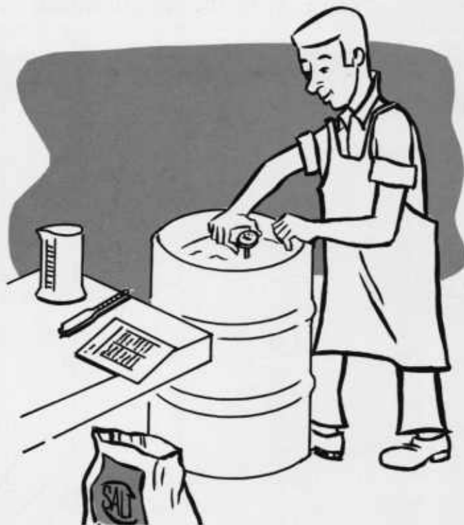
That final check is important.

Agitation greatly increases the rate at which salt