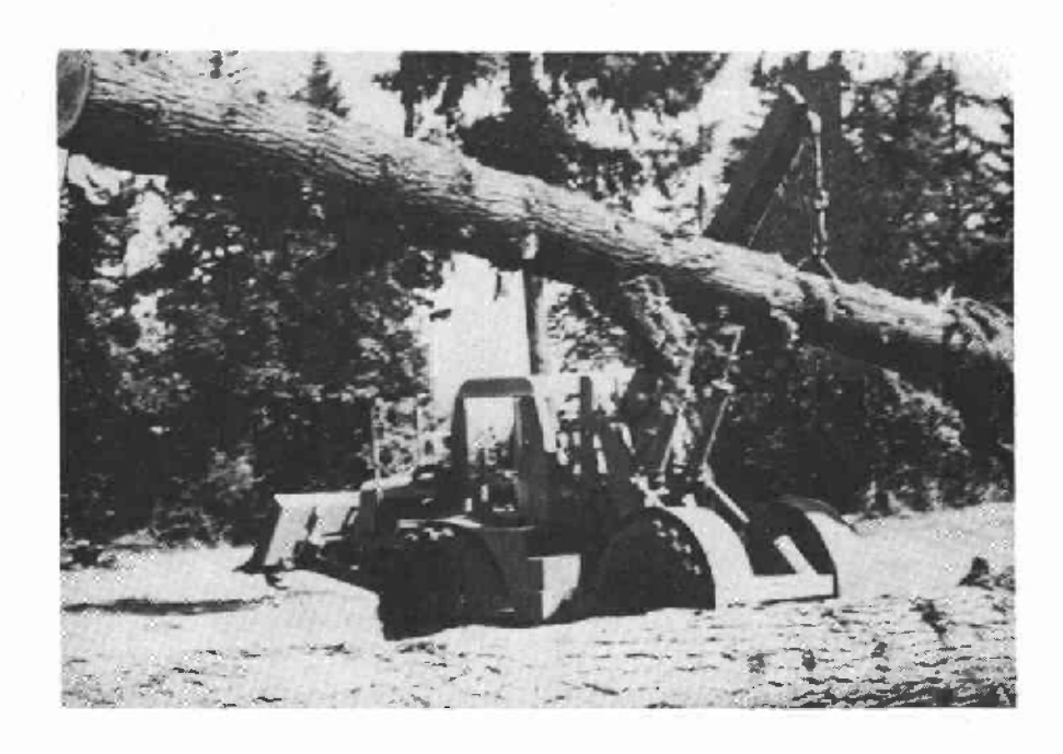
Figure 3. --Skidder-loader with boom extended and raised for loading logs.