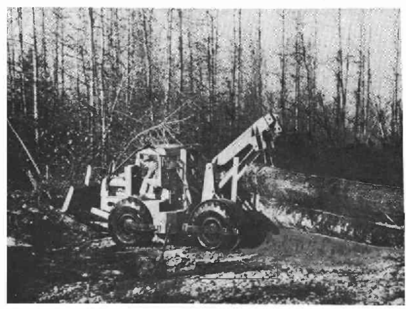
Figure 2. -- Skidder-loader skidding tree-length logs.