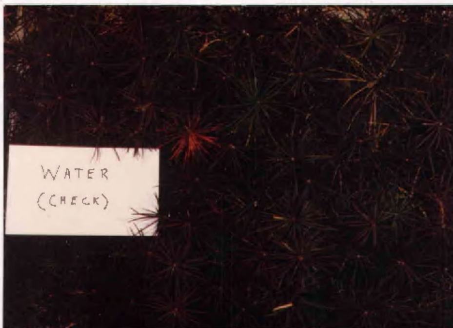
Figure 2.--Containerized western larch seedlings treated with water (check) at the Champion Timberlands Nursery, Plains, MT. Most seedlings in this and other fungicide treatments (except vinclozolin) remained green and healthy looking.