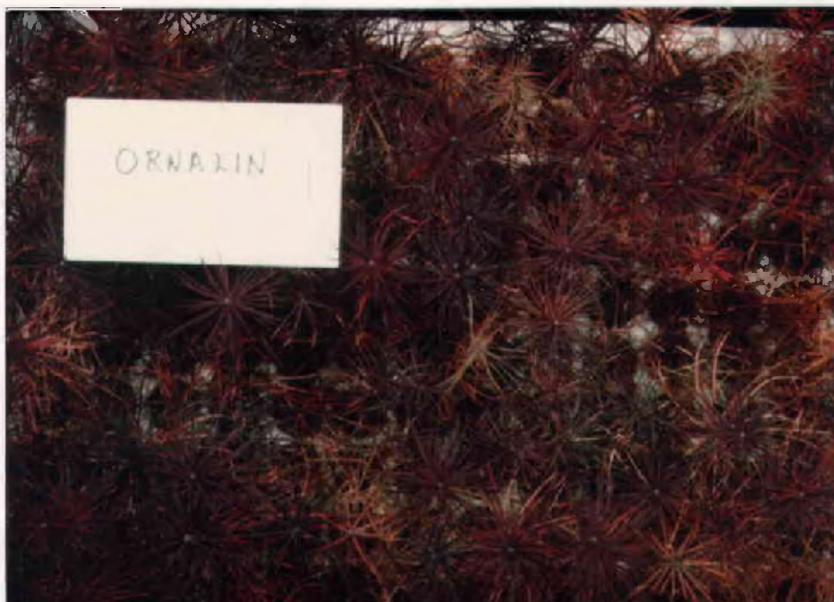
Figure 1.--Containerized western larch seedlings treated with vinclozolin (Ornalin®) at the Champion Timberlands Nursery, Plains, MT. Many seedlings were defoliated; foliage of treated seedlings often became reddish-brown in color.