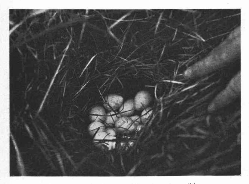
Figure 2. Bobwhites increase rapidly under proper conditions.

has been attained with bobwhites in western Oregon, and recent management practices have shown them to be responsive, but they cannot be manipulated on the same basis as the Chinese pheasant. In management, the food supply is important. The best plants for providing quail food are those that yield a crop of small seeds, including such legumes as red and alsike clovers. The clovers not only provide seed for winter use but green foliage that is eaten at other seasons.