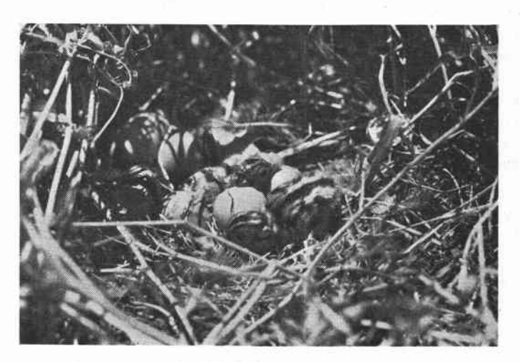
Successful Nests Are Sport Insurance

Oregon State System of Higher Education Agricultural Experiment Station Oregon State College, Corvallis United States Fish and Wildlife Service, Oregon State Game Commission, American Wildlife Institute,