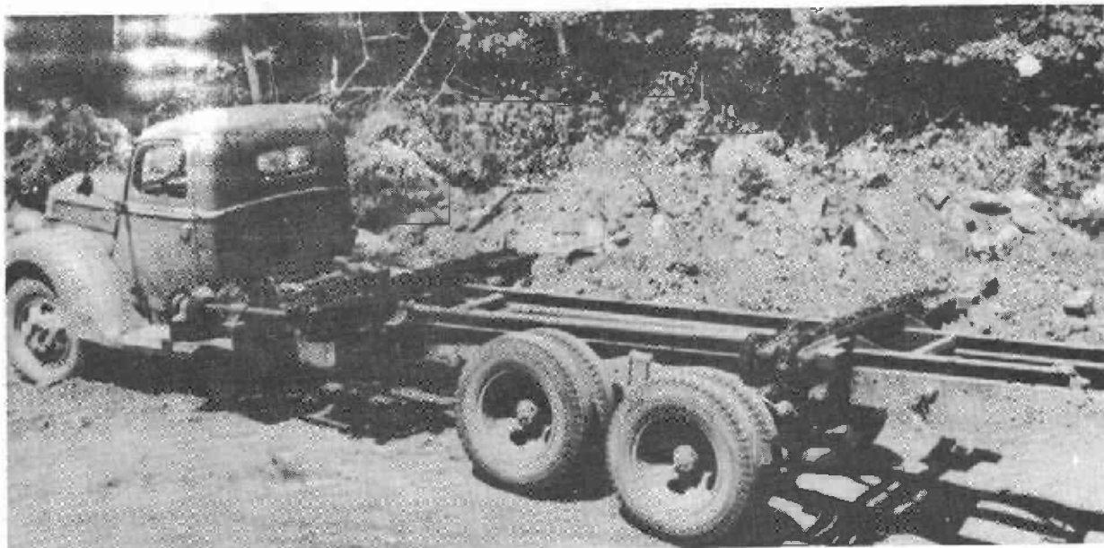
Figure 1.--Truck unit showing loading mechanism.