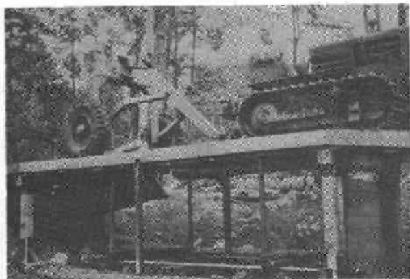
Figure 2.--Divided ramp and detachable truck body ready for loading.