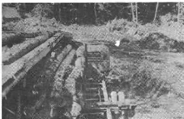
Figure 4.--Loading the detachable truck body.