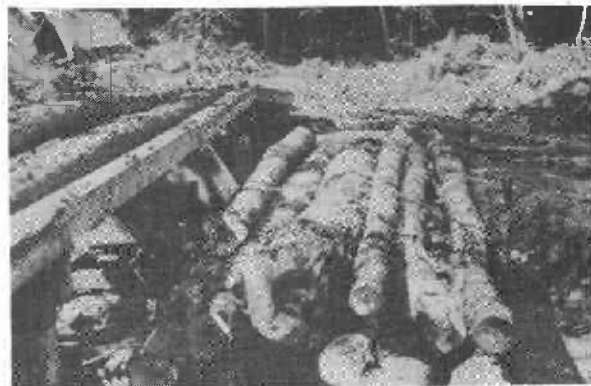
Figure 5.--Loaded truck ready to leave.