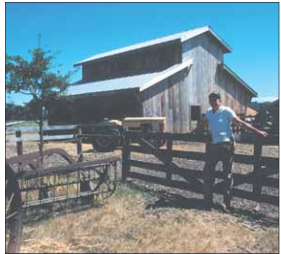
East of the Cascades, saline or alkaline soils can limit crop options.

Various Extension publications detail crop water-use requirements at various locations in Oregon. The estimates take into account irrigation method, crop growth stage, and weather (see page 16).