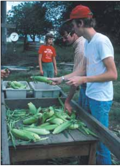
Growing a crop that you enjoy working with and believe in will get you through hard times and help you market it.

In Oregon, water resources are controlled by state authorities and are distributed to landowners based on historic use and the quantity available. This system prevents one landowner from damming a river that serves many other landowners. The recent regulations supporting salmon recovery often require higher minimum stream flows during certain seasons, further restricting water withdrawals for irrigation.