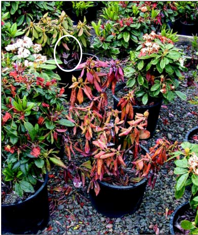
Figure 10 (above left).—Rhododendron 'Unique' plants with ramorum leaf blight. Plant in center foreground was killed by ramorum leaf blight; plant in background shows early symptoms of ramorum leaf blight on lower leaves.