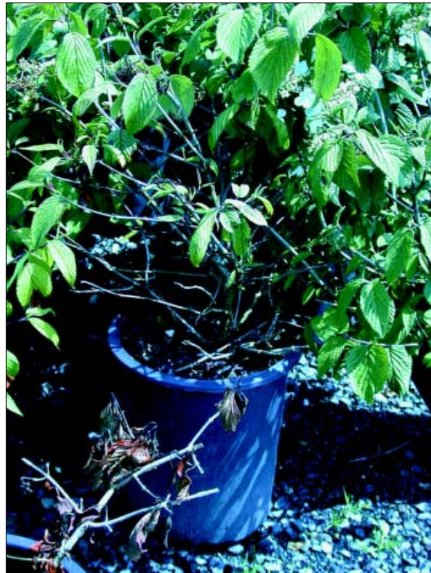
Figure 3 (above).— Viburnum plicatum var. tomentosum ‘Mariesii’ infected with P. ramorum , showing a necrotic leaf as well as defoliation near the base of the plant.

Phytophthora ramorum is a funguslike organism well adapted to the cool, wet conditions of the Pacific Northwest and at the same time tolerant of heat and drought. Unlike most Phytophthora species that infect roots, P. ramorum is mainly a foliar pathogen. It produces several spore types, which helps the organism survive and spread (Figure 4). Spores landing on wet leaves or stems germinate and infect the plant. Young leaves are especially susceptible. Within a few days, sporangia are produced, and they release tiny,