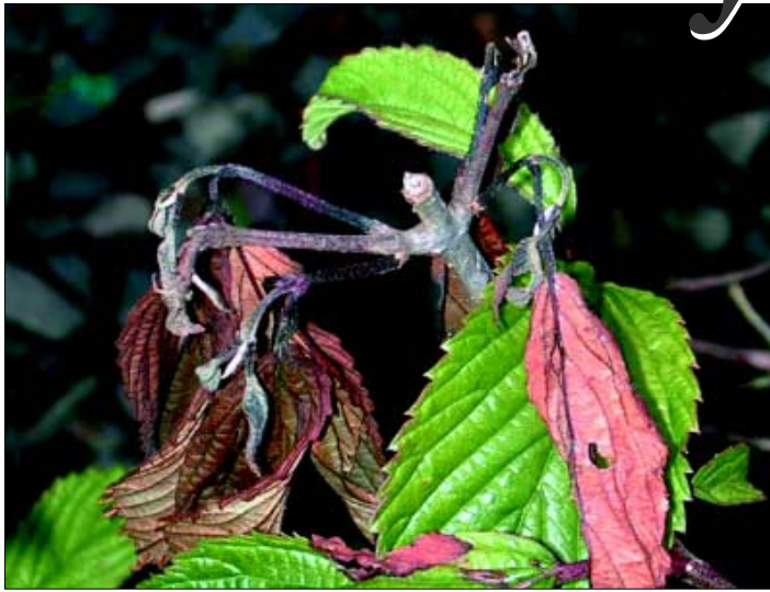
Figure 1.— Ramorum shoot dieback and leaf blight on Viburnum x bodnantense 'Dawn'.

A newly described funguslike organism named Phytophthora ramorum was discovered in 1993 to cause leaf blight, stem canker, and tip dieback on nursery-grown rhododendrons and viburnums in Germany and the Netherlands. At about the same time, many tanoaks ( Lithocarpus densiflorus ) and oaks ( Quercus sp.) in the San Francisco Bay Area were dying from a new disease. The cause of this “sudden oak death” was also Phytophthora ramorum .