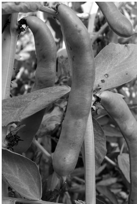
Fava beans make an excellent spring cover crop.

http://extension.oregonstate.edu/catalog