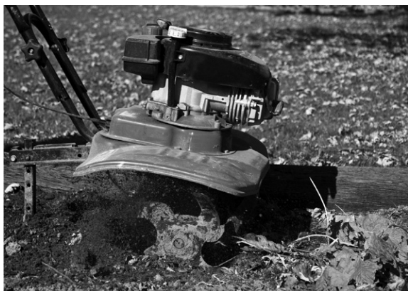
To preserve soil structure, till with a purpose and only when soil moisture is neither too wet or too dry.

Never till soil when it is wet. Doing so will leave you with cloddy, compacted soil. To test soil moisture, take a handful of soil and squeeze it. If it stays in a mud ball, it's too wet to till. If it is powdery and clumped, it is too dry. If it crumbles freely, it is just right.