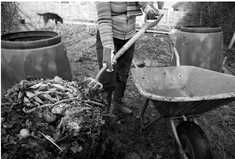
A closed composting bin is a good way to recycle fruit and vegetable scraps while keeping out pests.

You can compost many types of organic materials. Sod, grass clippings (avoid clippings from lawns recently treated with weed killers), healthy leaves, hay, straw, young weeds (avoid seed-laden weed material), manure, chopped corn stalks, shredded newspaper, and many kinds of vegetable and fruit refuse from the kitchen are good materials for composting. Shredding or otherwise converting the material into small particles speeds up the composting process.