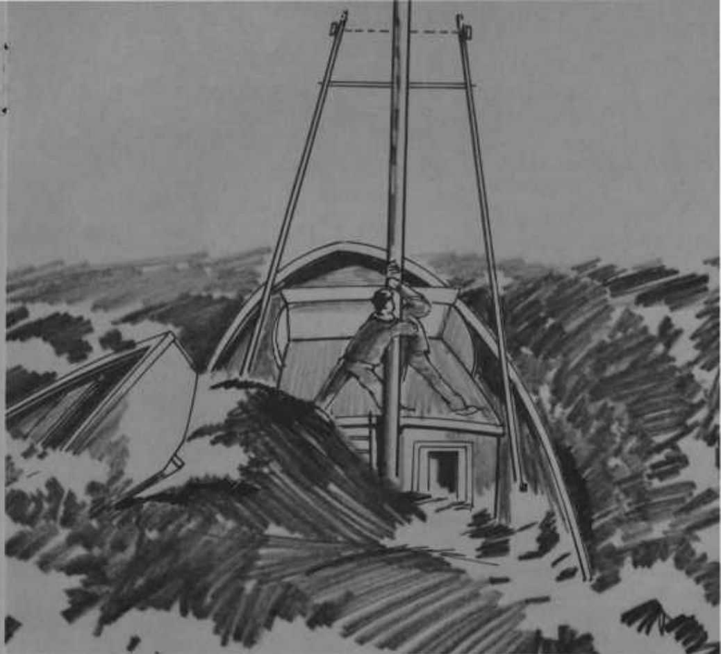
Arlo and Tim climbed the mast as Starfisher continued to settle.

The sea may forgive a careless error or two, but those who compound one error into a series of mistakes and return to tell about it are few and fortunate.