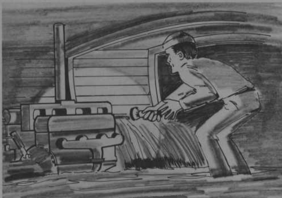
The bilge pump was not staying ahead of the rising water.